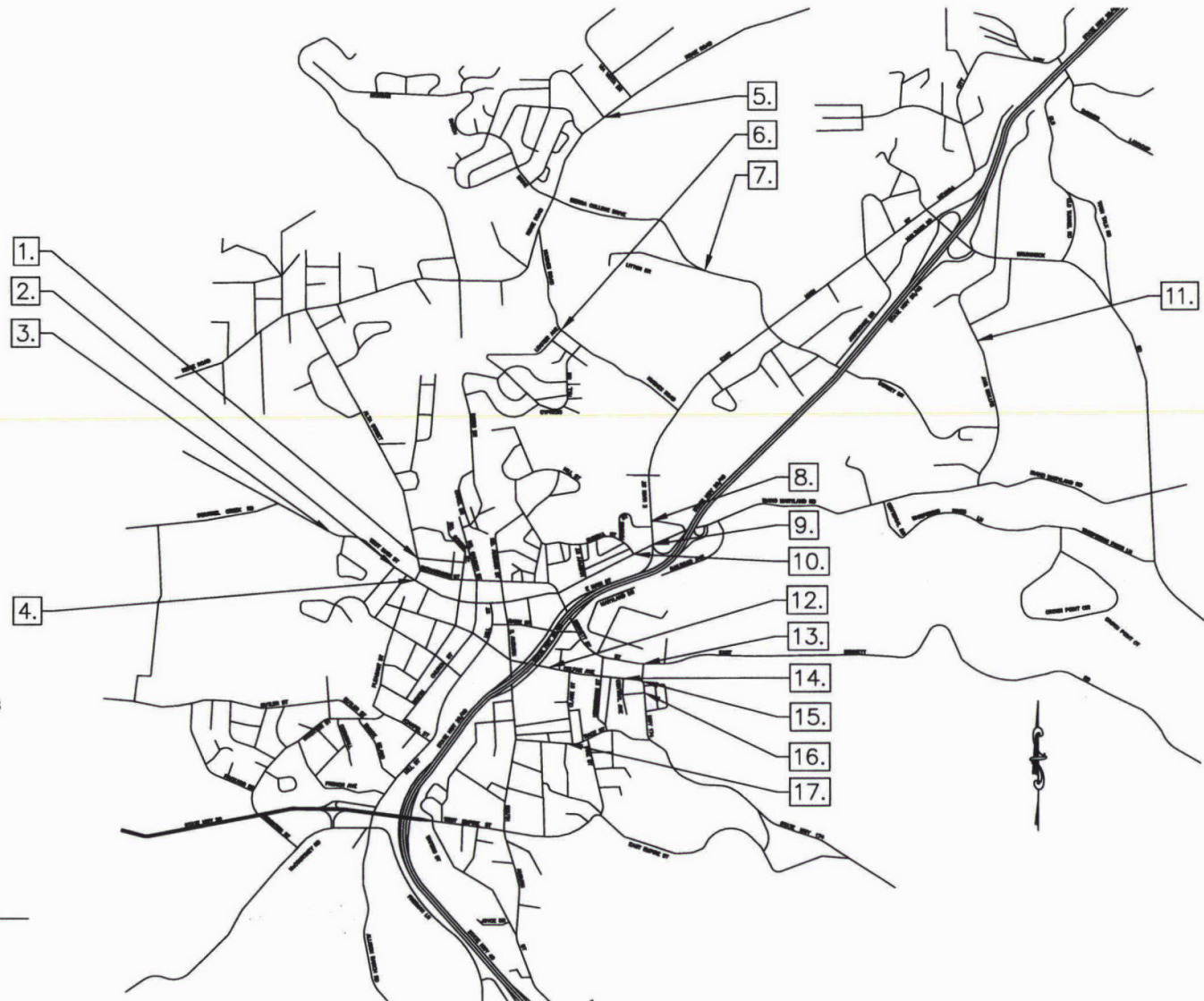
LOCATION MAP - GRASS VALLEY, CA NOT TO SCALE