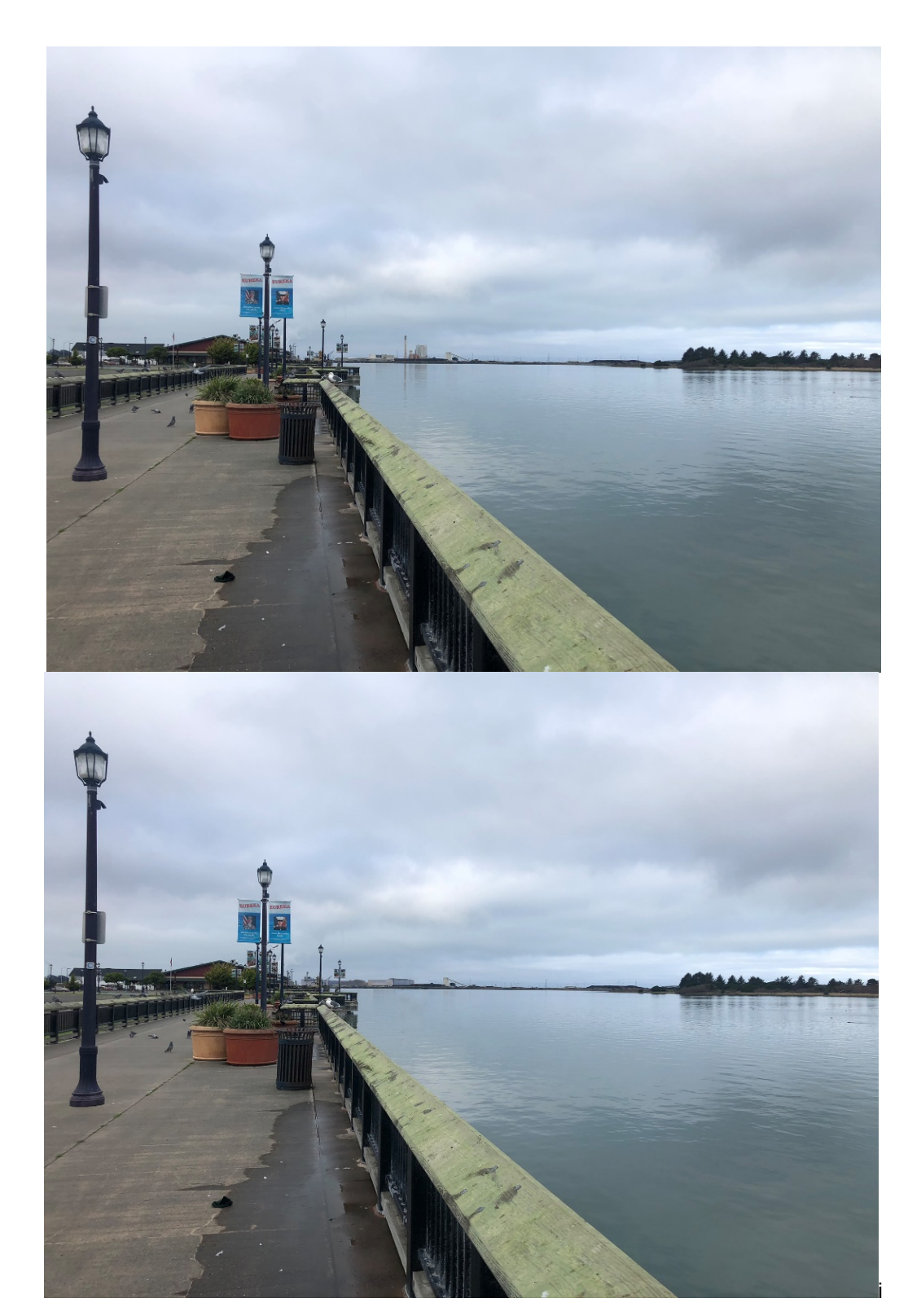
Figure 4 Existing conditions and visual simulation looking southwest from the Eureka Boardwalk.