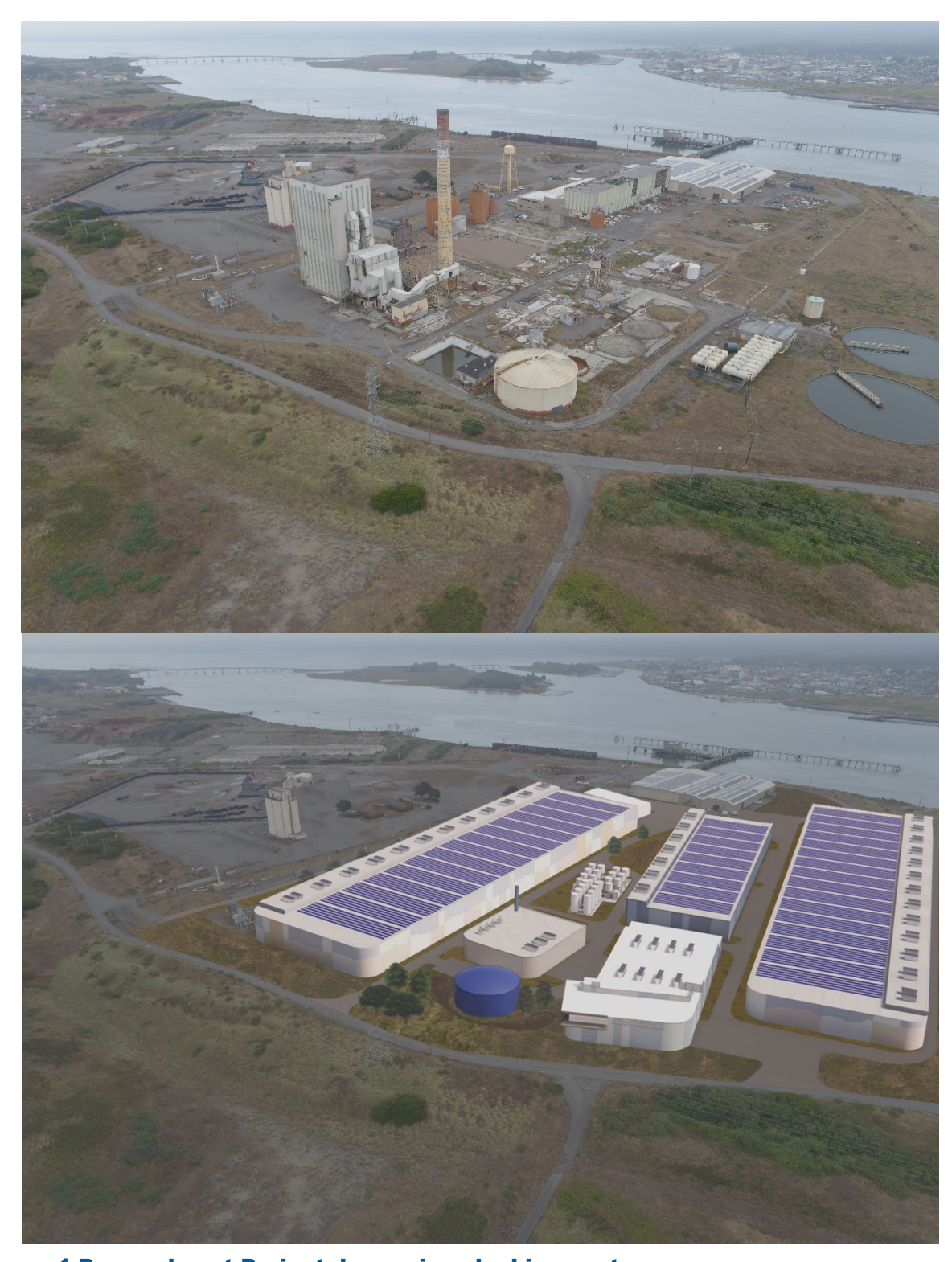
Figure 1 Pre- and post-Project drone view, looking east.