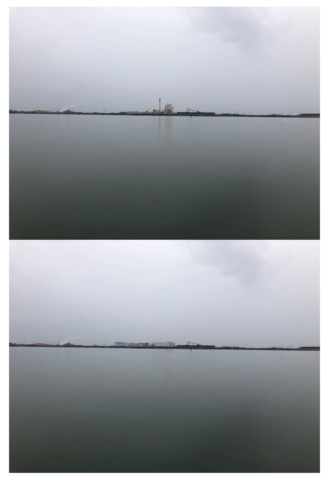
Figure 3 Existing conditions and visual simulation looking west from the Wharfinger Building and Public Marina.