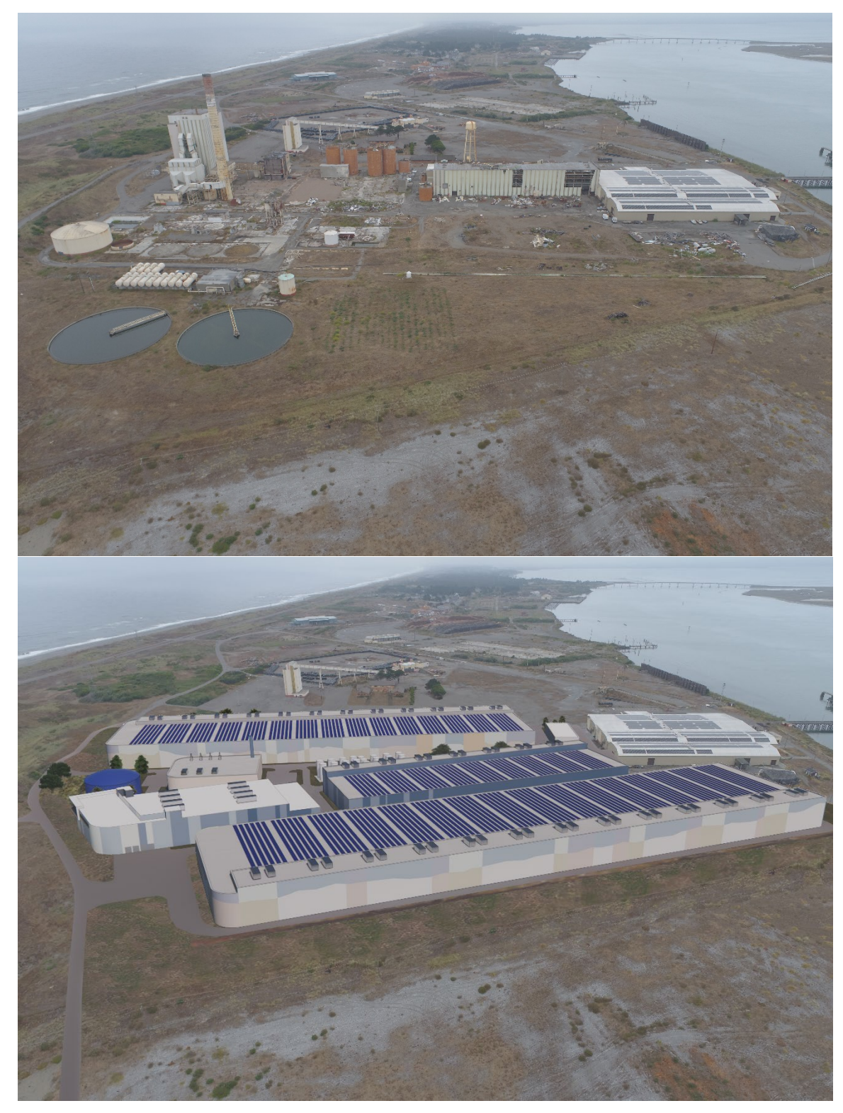
Figure 2 Pre- and post-Project drone view, looking north.