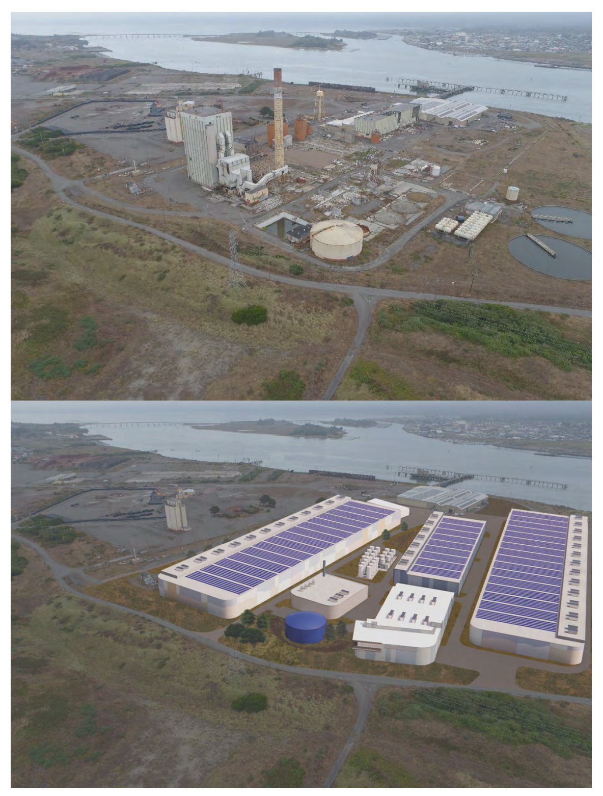
Figure 1 Pre- and post-Project drone view, looking east.