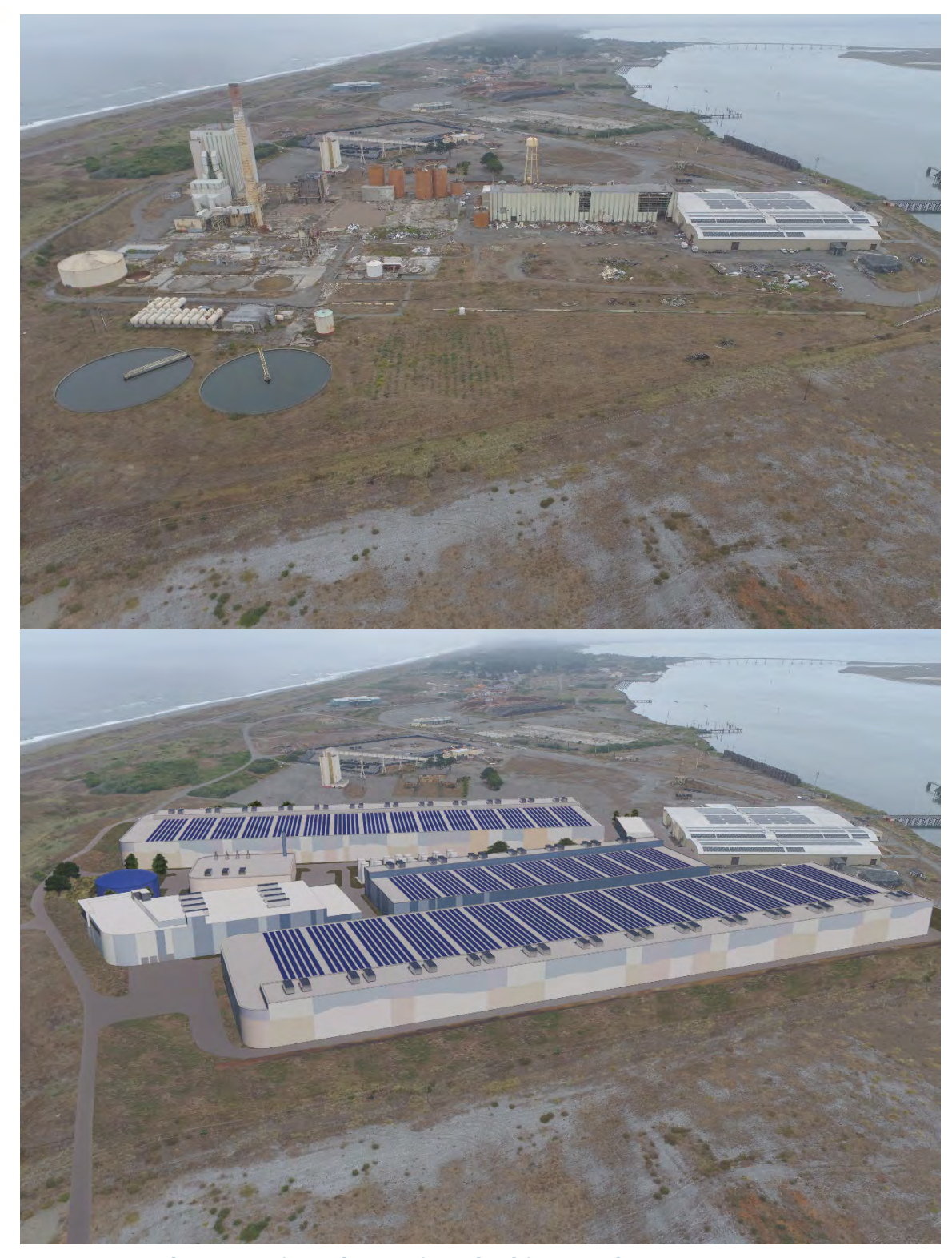
Figure 2 Pre- and post-Project drone view, looking north.