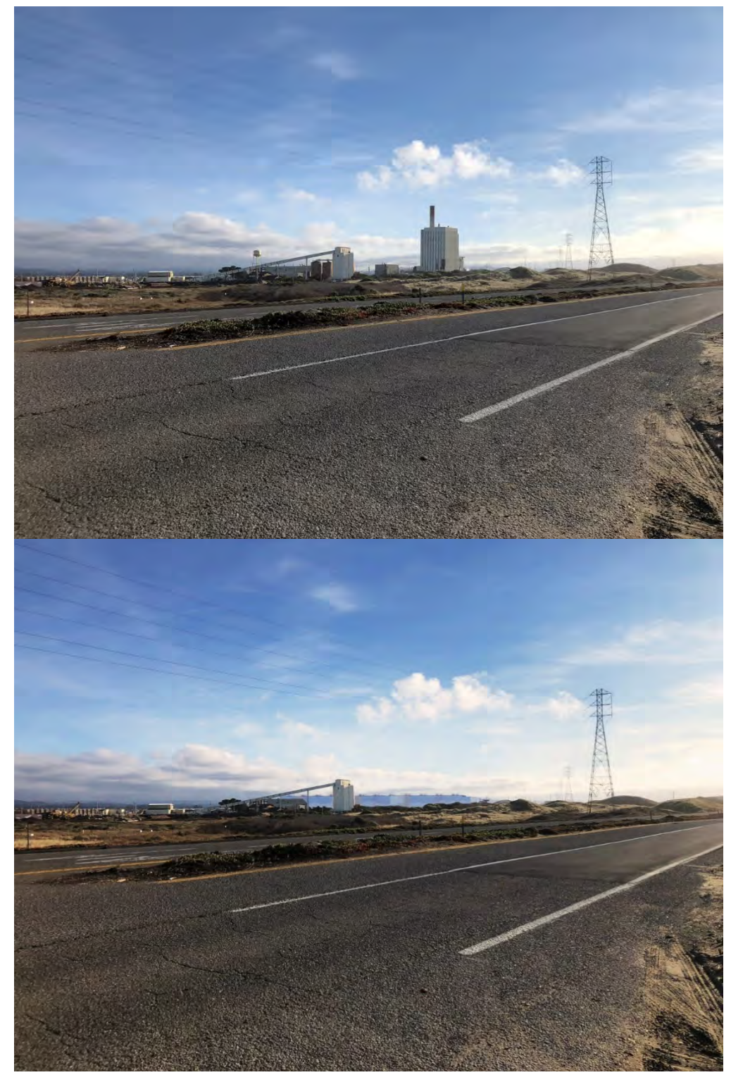
Figure 8 Existing conditions and visual simulation looking southeast from New Navy Base Road.