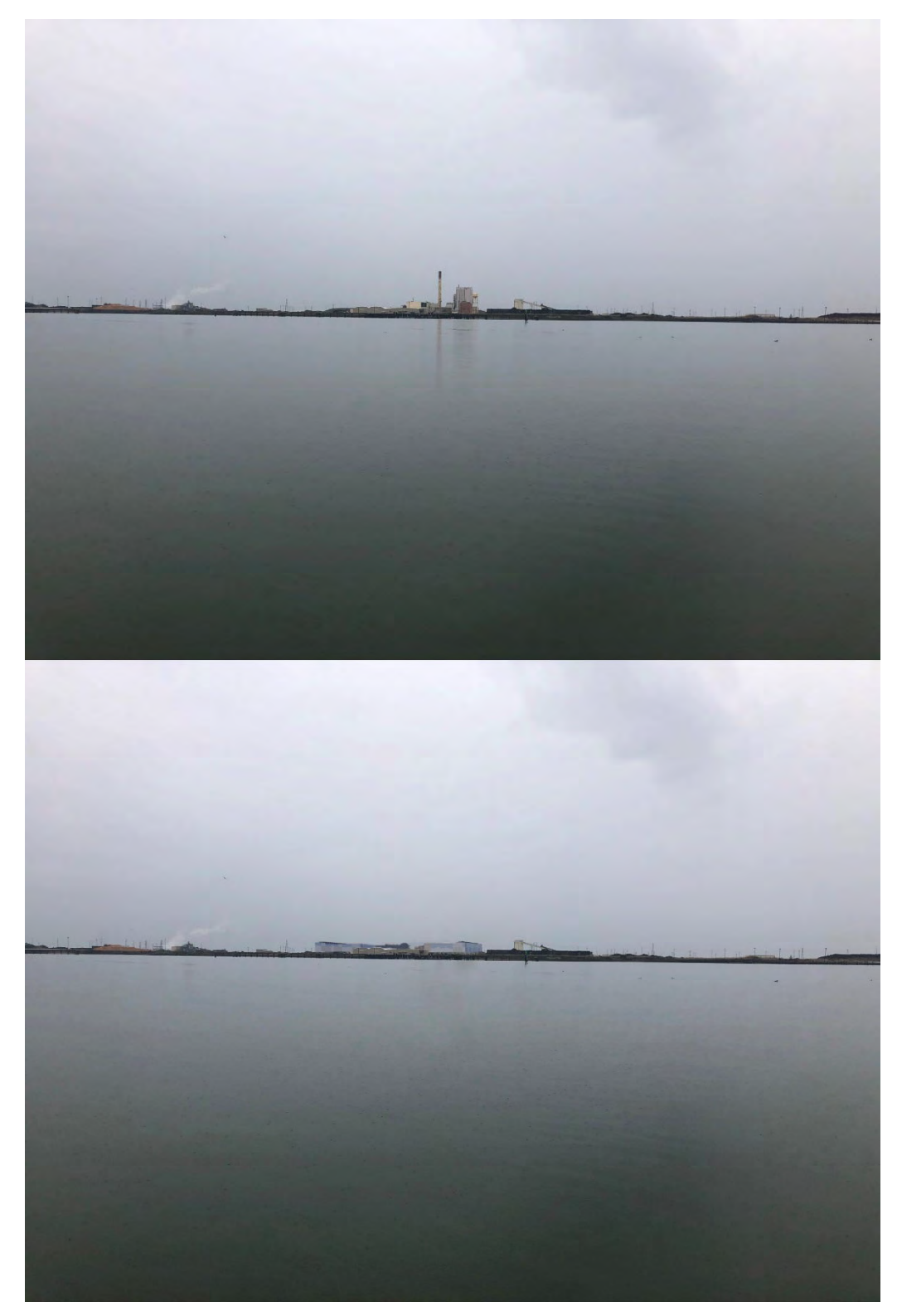
Figure 3 Existing conditions and visual simulation looking west from the Wharfinger Building and Public Marina.