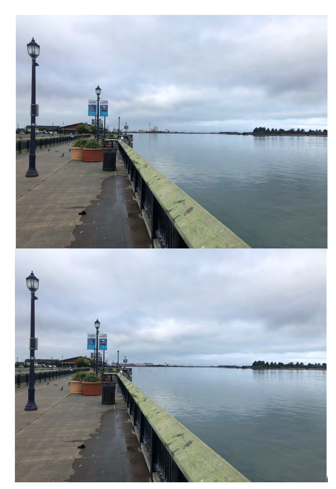
Figure 4 Existing conditions and visual simulation looking southwest from the Eureka Boardwalk.