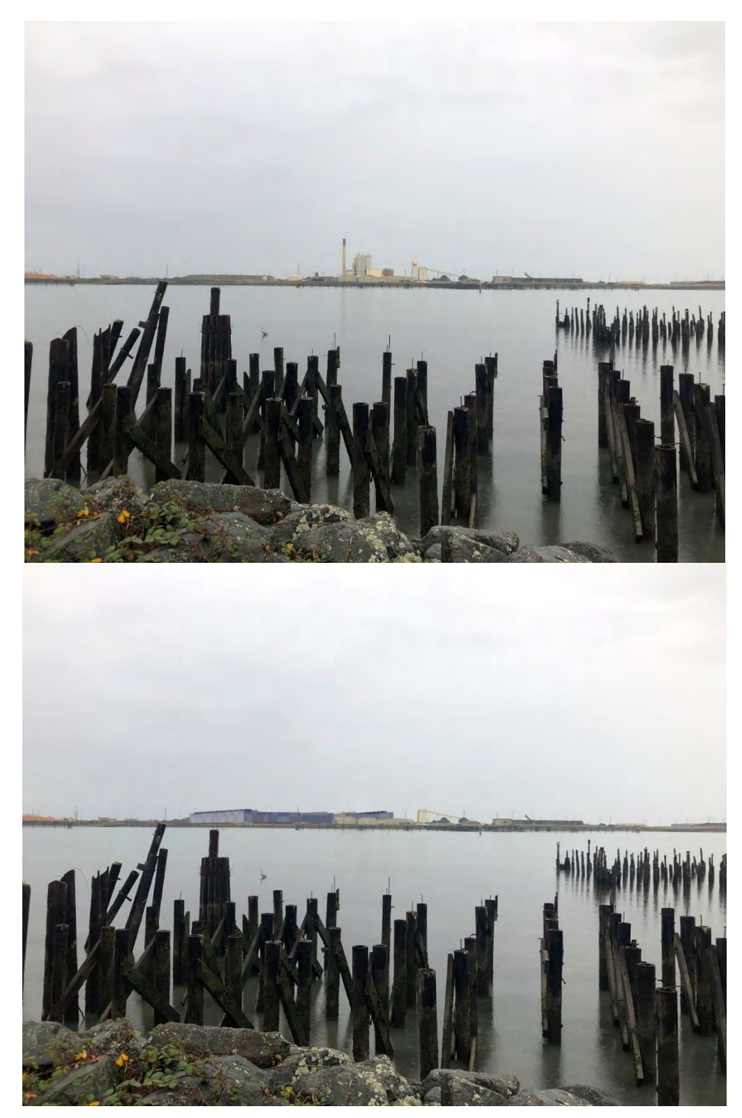
Figure 5 Existing conditions and visual simulation looking west from the Waterfront Trail, Eureka.