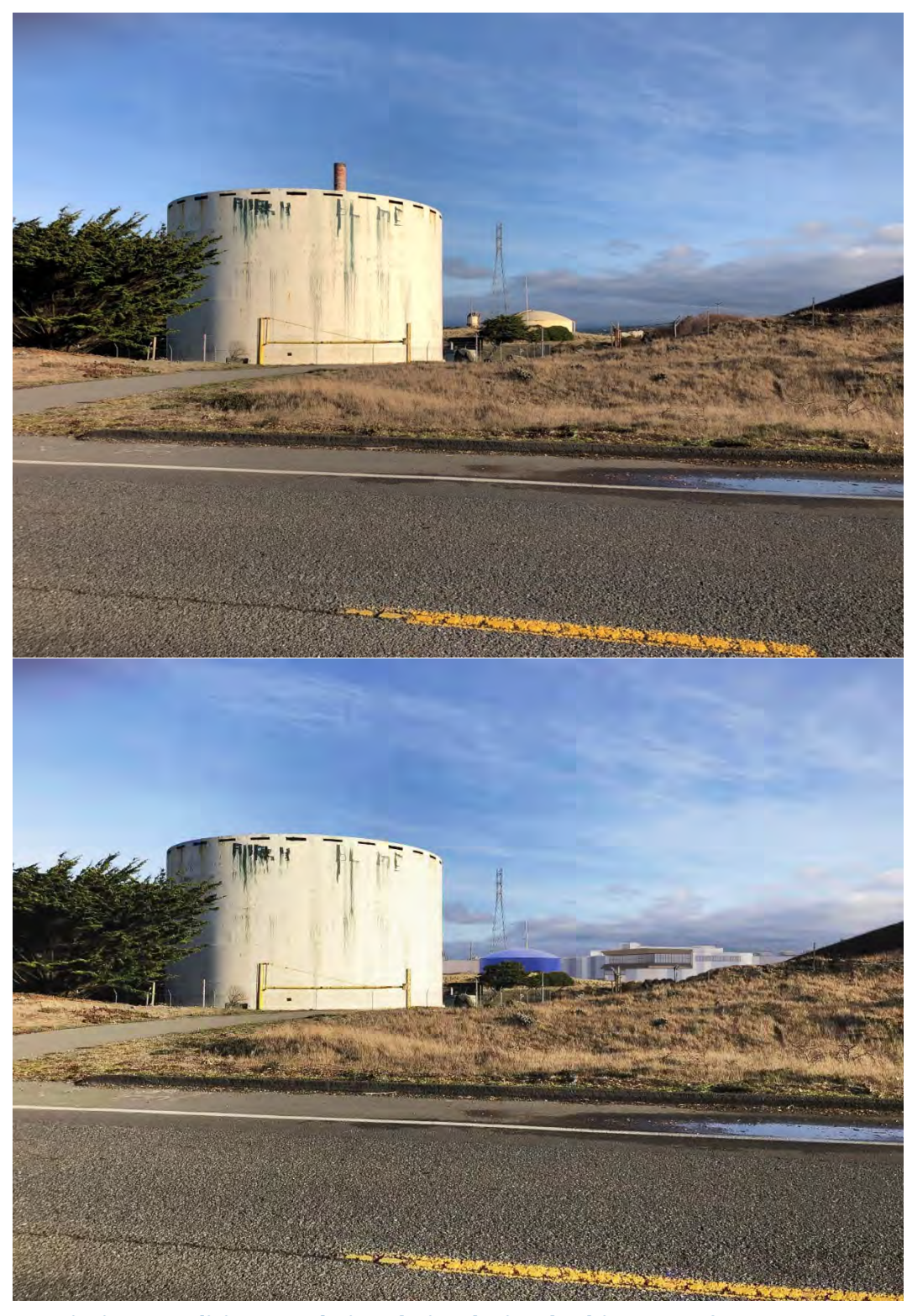
Figure 6 Existing conditions and visual simulation looking east from New Navy Base Road.