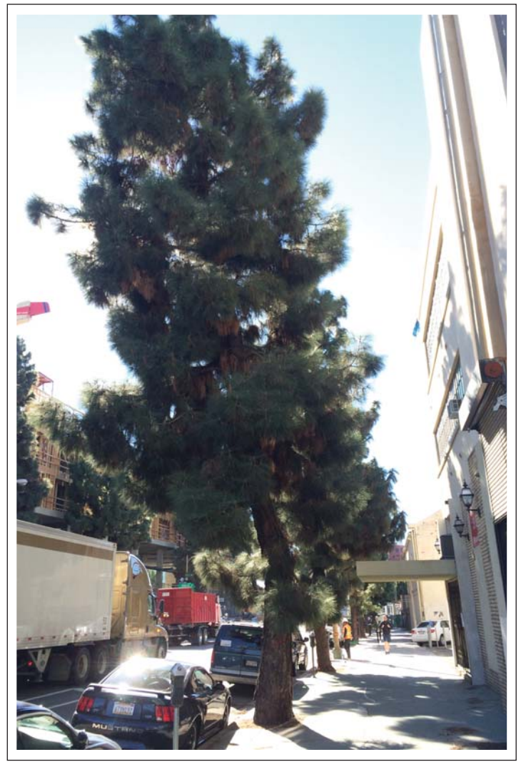
December 14, 2015. View of Tree Number 2