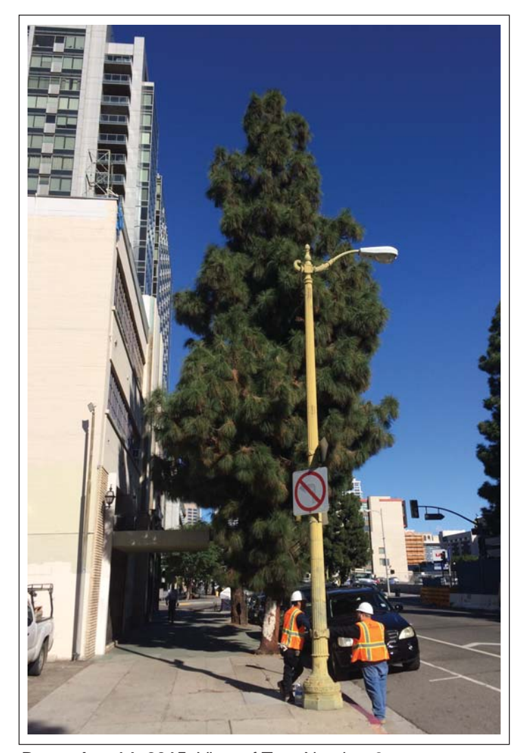
December 14, 2015. View of Tree Number 3