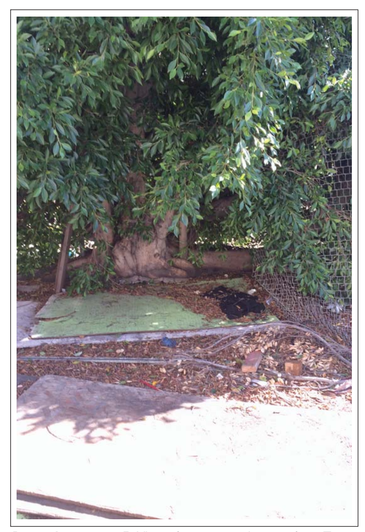
December 14, 2015. View of pavement damage from Tree Number 1