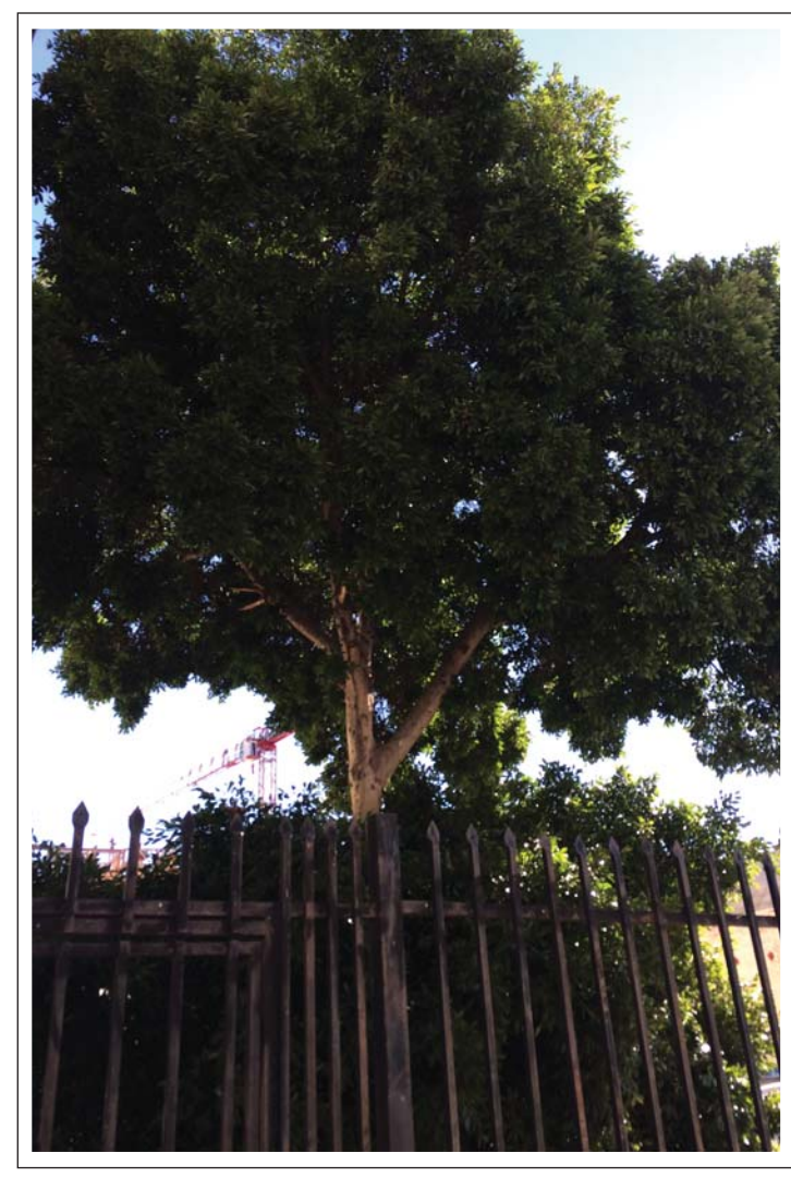
December 14, 2015. View of Tree Number 1