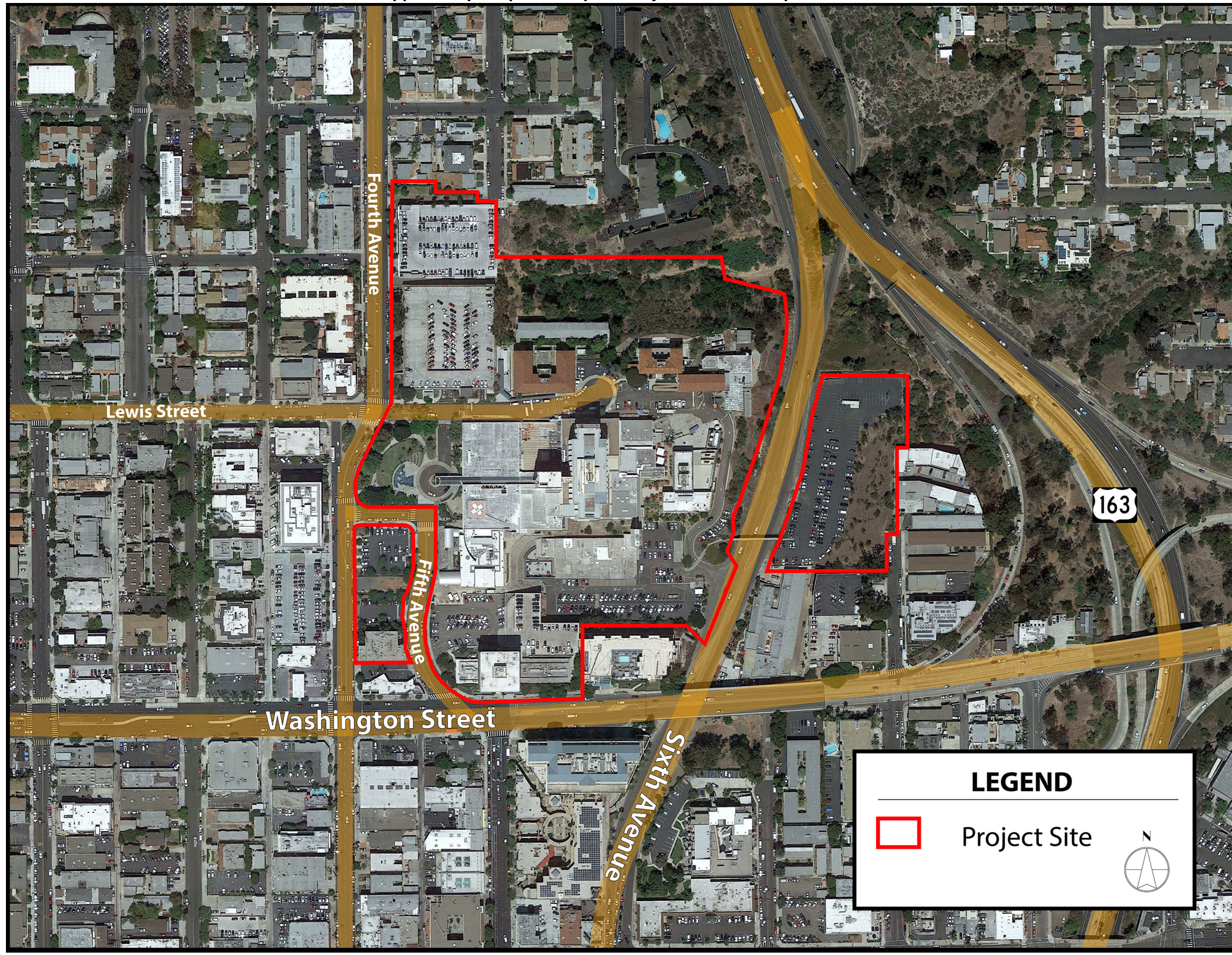
Figure 2 Scripps Mercy Hospital Campus - Project Location Map and Aerial