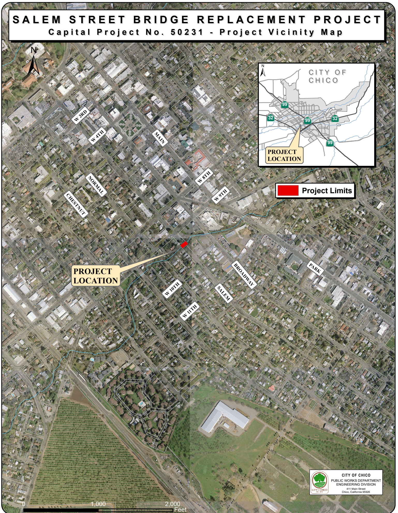
Figure 1 - Project Vicinity Map