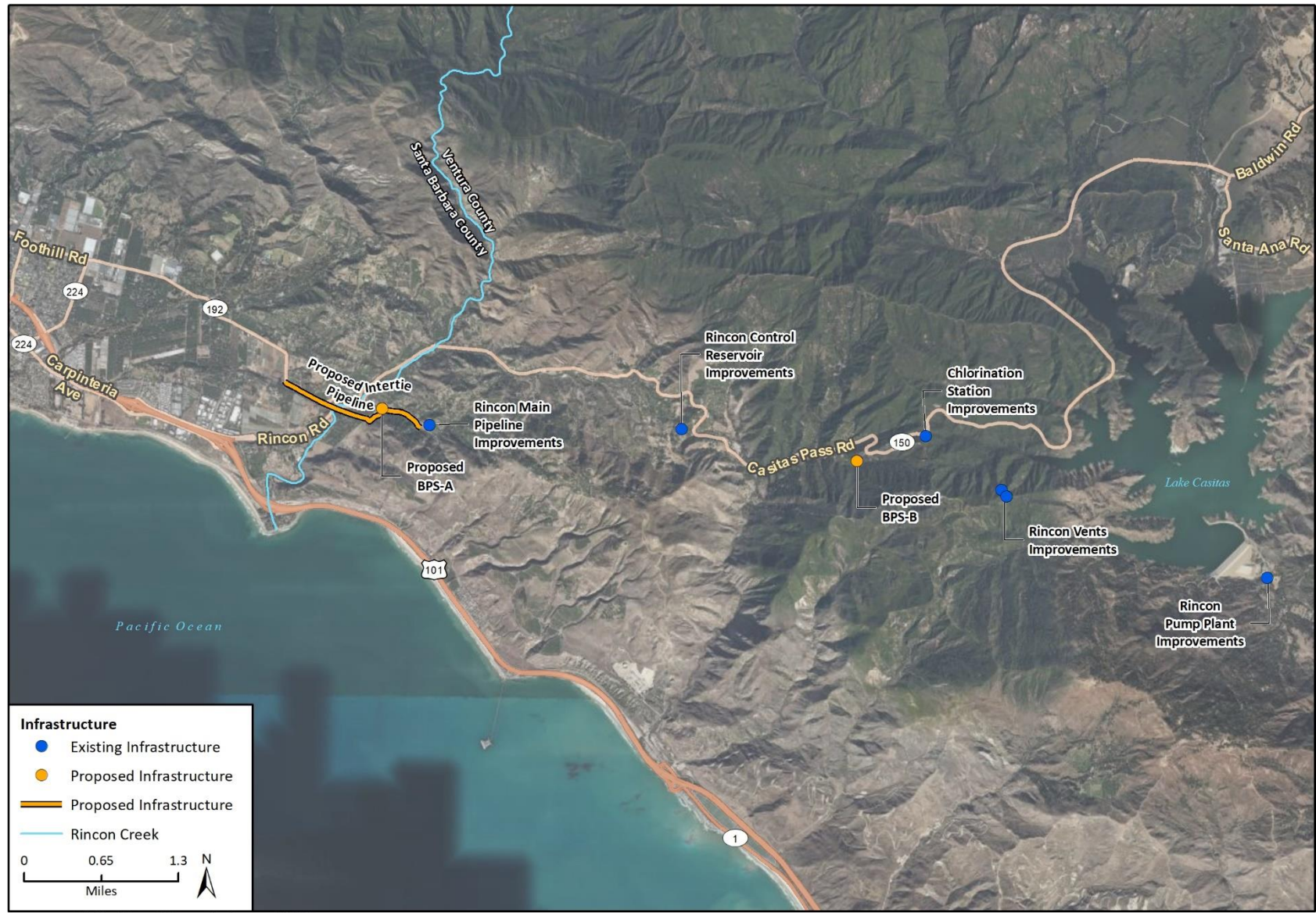
Figure 2 Overview of Project Site