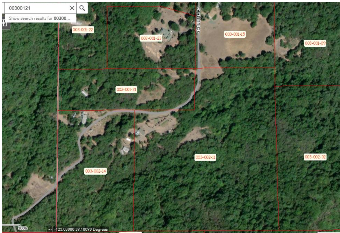
Aerial Photo of Site and Surrounding Properties

Other public agencies whose approval may be required (e.g., Permits, financing approval, or participation agreement.)