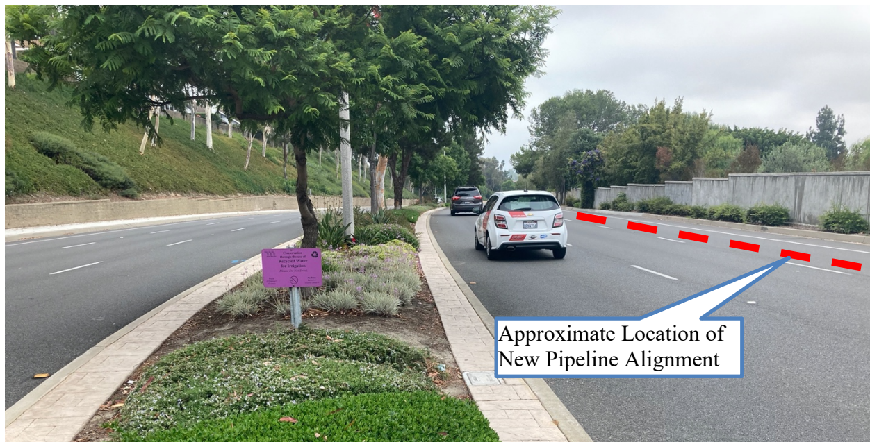
Figure 2-1. Typical view of Crown Valley Parkway; view north near the intersection with Paseo de Niguel.

The relocated water main would be constructed within the right-of-way of Crown Valley Parkway (Figure 2-1). The new pipeline alignment would begin at a point where the existing JRWSS heads easterly, away from its parallel alignment with Crown Valley Parkway. From this connection point, the new alignment would continue north for approximately 2,350 feet in Crown Valley Parkway where it would rejoin the existing pipeline (Figure 1-1). Figure 2-1 provides a view of Crown Valley Parkway just north of the intersection with Paseo de Niguel. The proposed location of the replacement water pipeline is located in the north-bound right lane to avoid other water, sewer, and utilities located within the right-of-way.