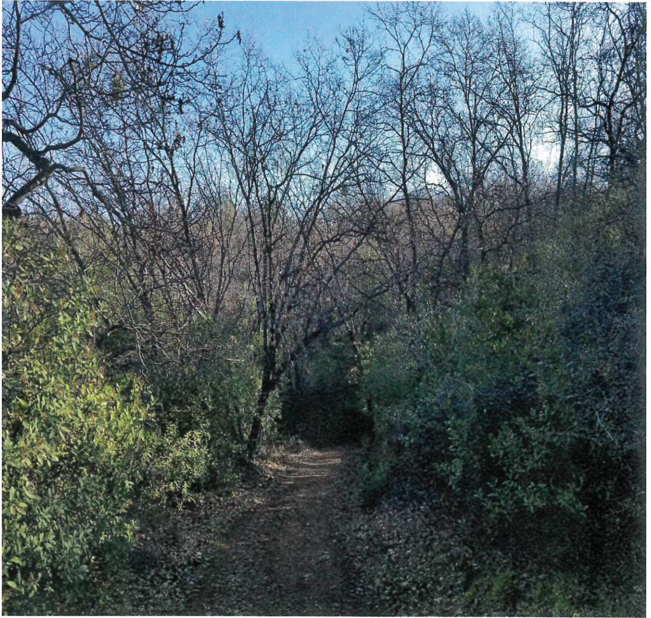
Figure 2 10 Mile House Rd at intersection with Guardian Trail GPS 39.80554983, -121.71707247