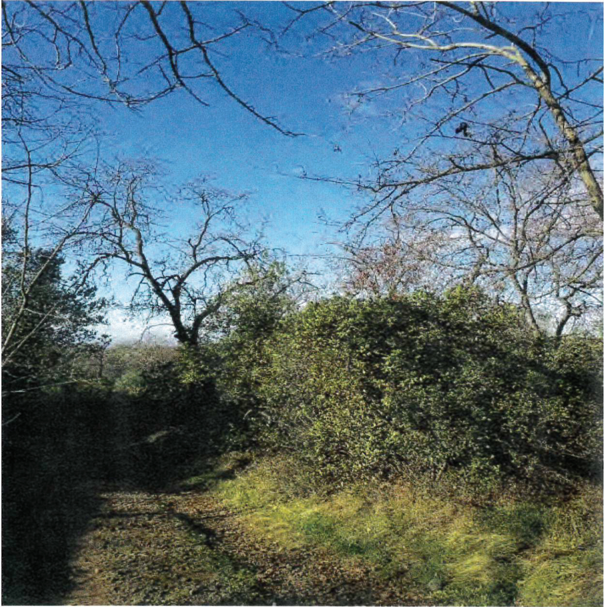
Figure 1 500 feet from the top of 10 Mile House Rd. Looking west. GPS 39.8058555, -121.71419716