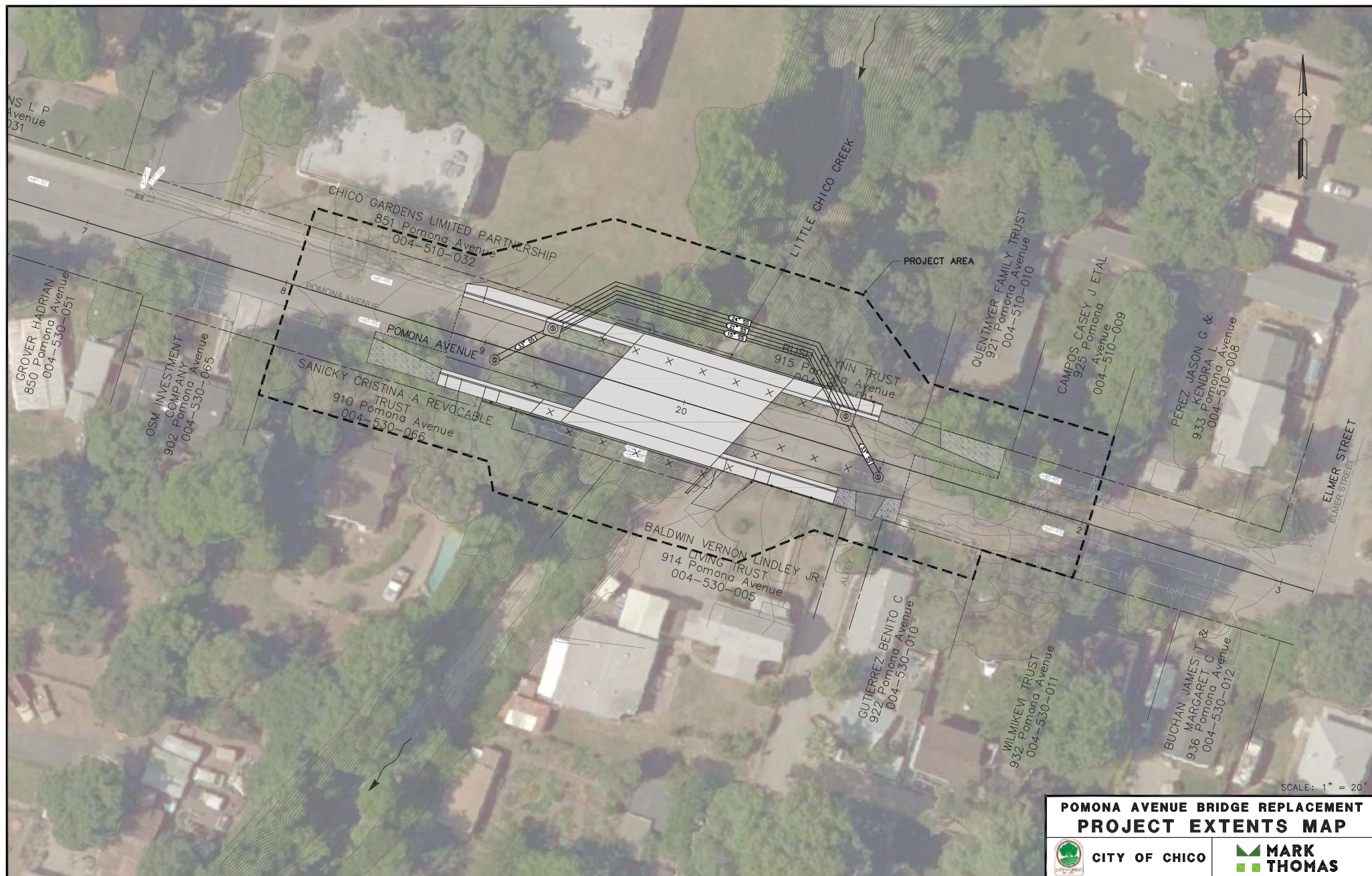
Figure 2 - Site Plan