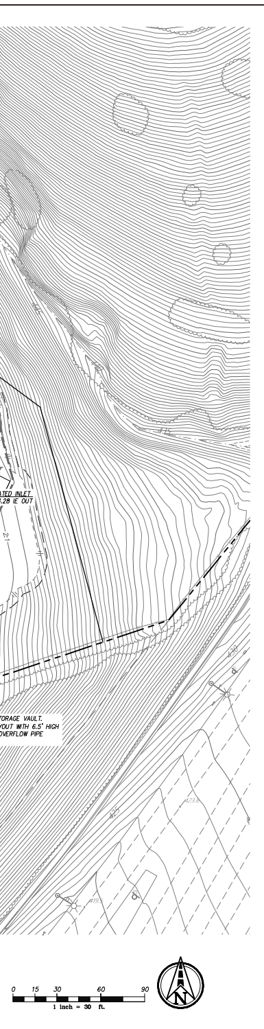
FIGURE 2 Site Plan Paseo Montril Development Project