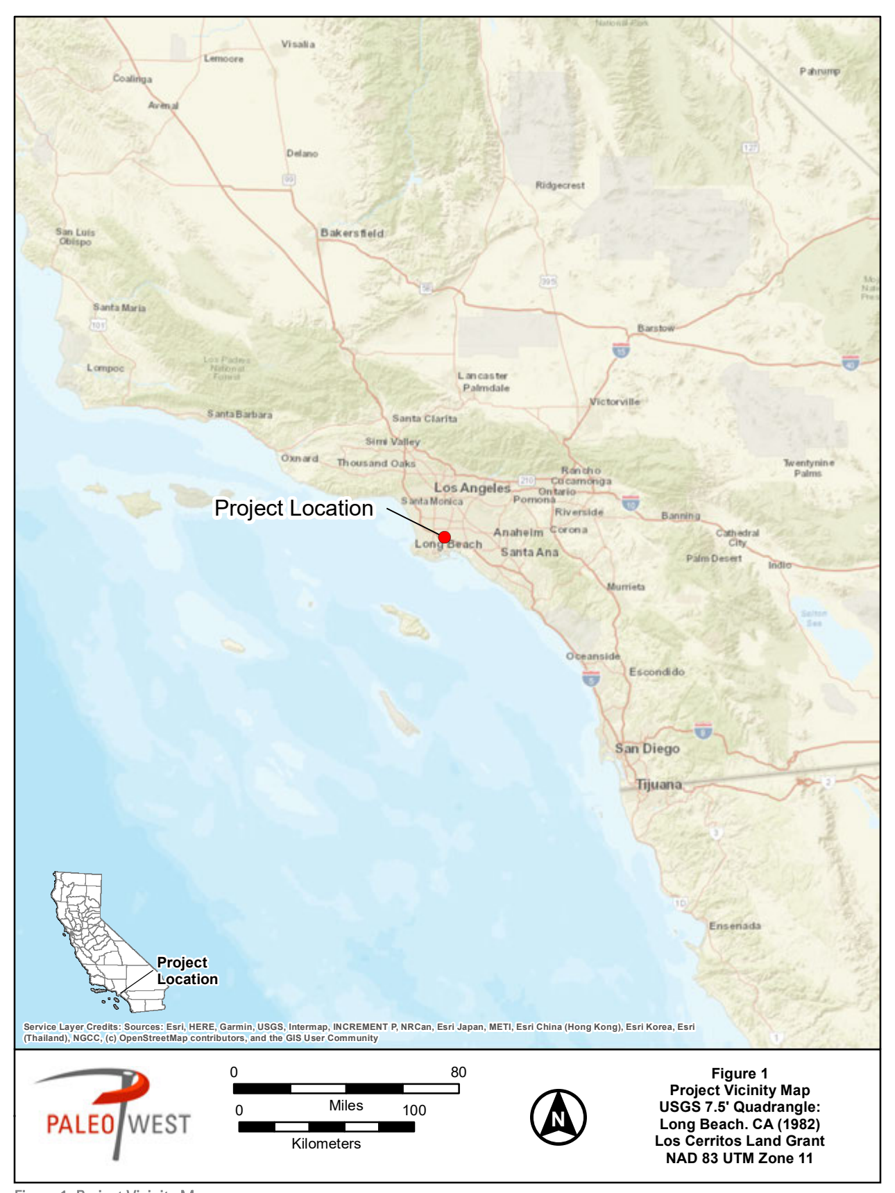
Figure 1. Project Vicinity Map