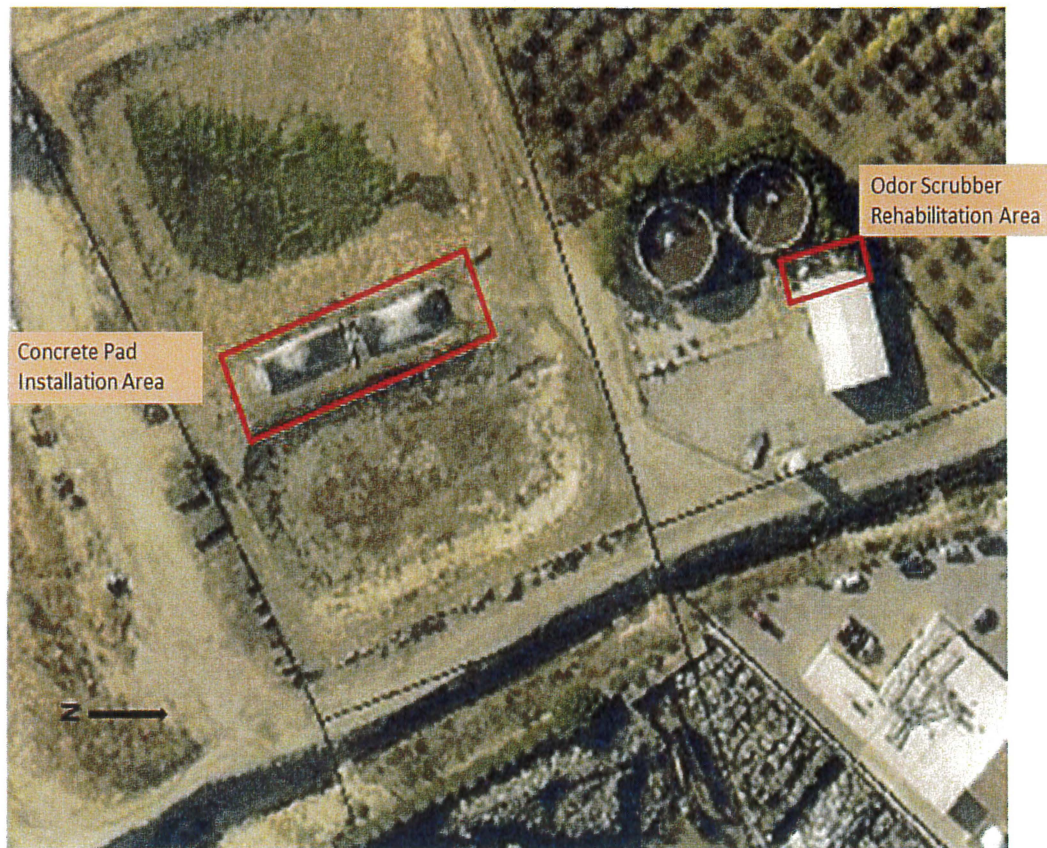
SSD 2021 WWTP Rehabilitation Project Detail A: Concrete Pad under Geotubes and Odor Scrubber Modifications