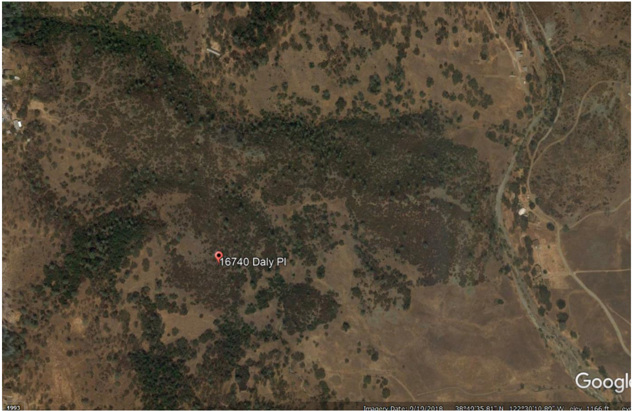
Aerial Photo of Site and Surrounding Properties

Other public agencies whose approval may be required (e.g., Permits, financing approval, or participation agreement.)