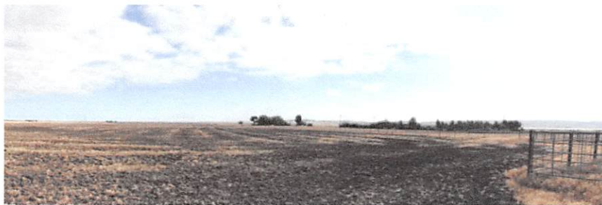
Figure 2: View of disked cultivation site

Cal Fire visited the site on 5/10/18 and provided recommendations for access and water supply for the cultivation operation. CalFire met with the agent on 1/24/2020 to discuss requirements with proposed changes (Please see attached email). As a result, the project will implement a 5000 gallon water tank with fire hose hook up as well as a 16' wide fire access road to the edge of the cultivation canopy. This road will include a hammerhead turnaround.