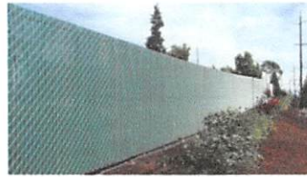
Figure 3: Concept of proposed fencing

A fence up to 8' high or as required with slatted chain linked fence, or as required, will encompass the outdoor cultivation. The fencing will provide both a visual barrier and security. Refer to the site plan for location