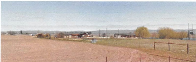
Photo: View of existing structures from HWY 58

Photo: Tule Elk Road access off of HWY 58