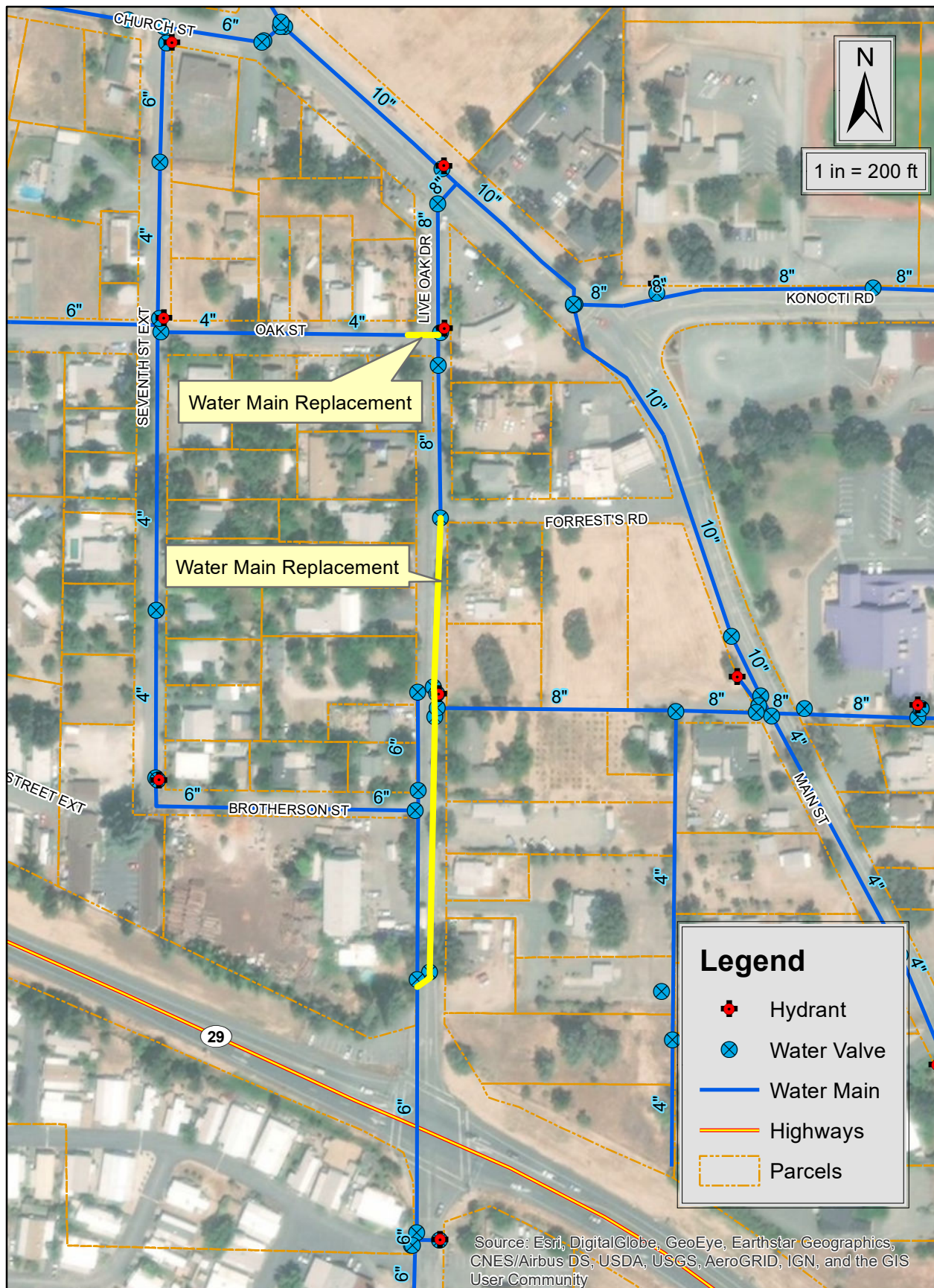
Live Oak Drive Water Main Replacement Project Location Map