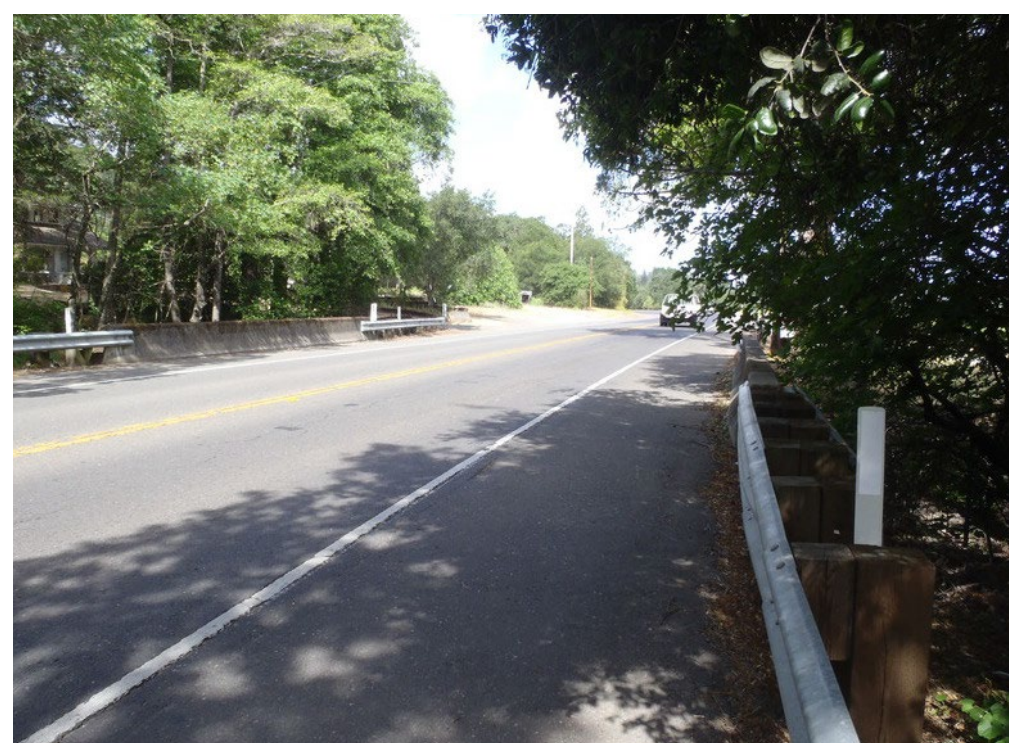
Figure 1-4 Upstream View of Bridge Opening