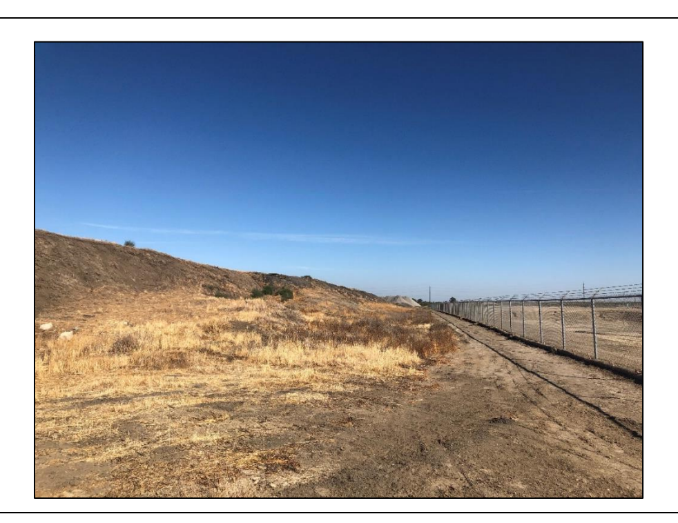
Figure 5. Overview of mound in southern end of Project site, facing east