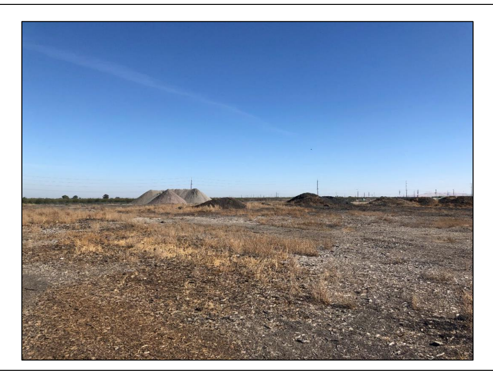
Figure 6. Overview of spoils piles in southeastern quadrant of Project site, facing southeast