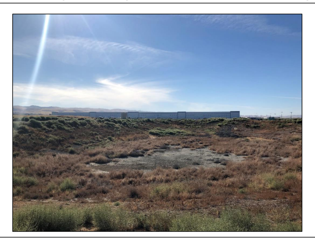
Figure 8. Overview of basin in northeastern quadrant of the Project site, facing west