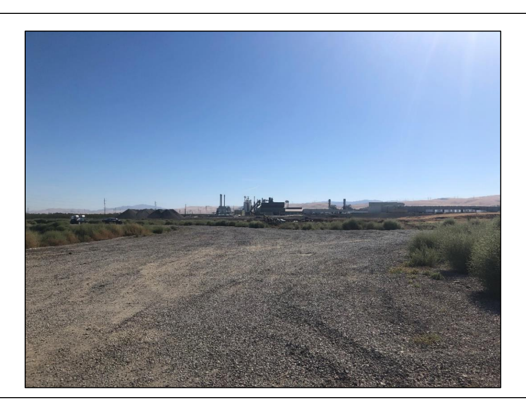
Figure 7. Overview of graded area with gravel north of the center of the Project site, facing south