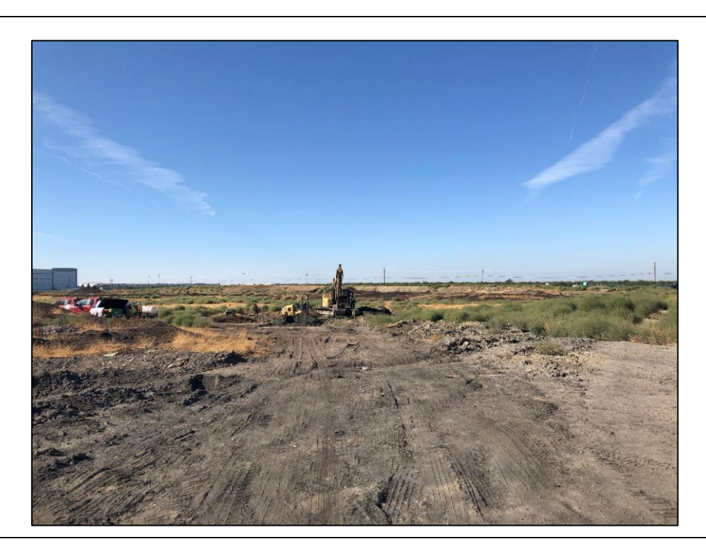
Figure 3. Overview of active excavation in center of Project site, facing northwest