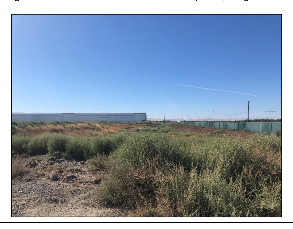
Figure 4. Overview of basin in northwestern quadrant of Project site, facing west