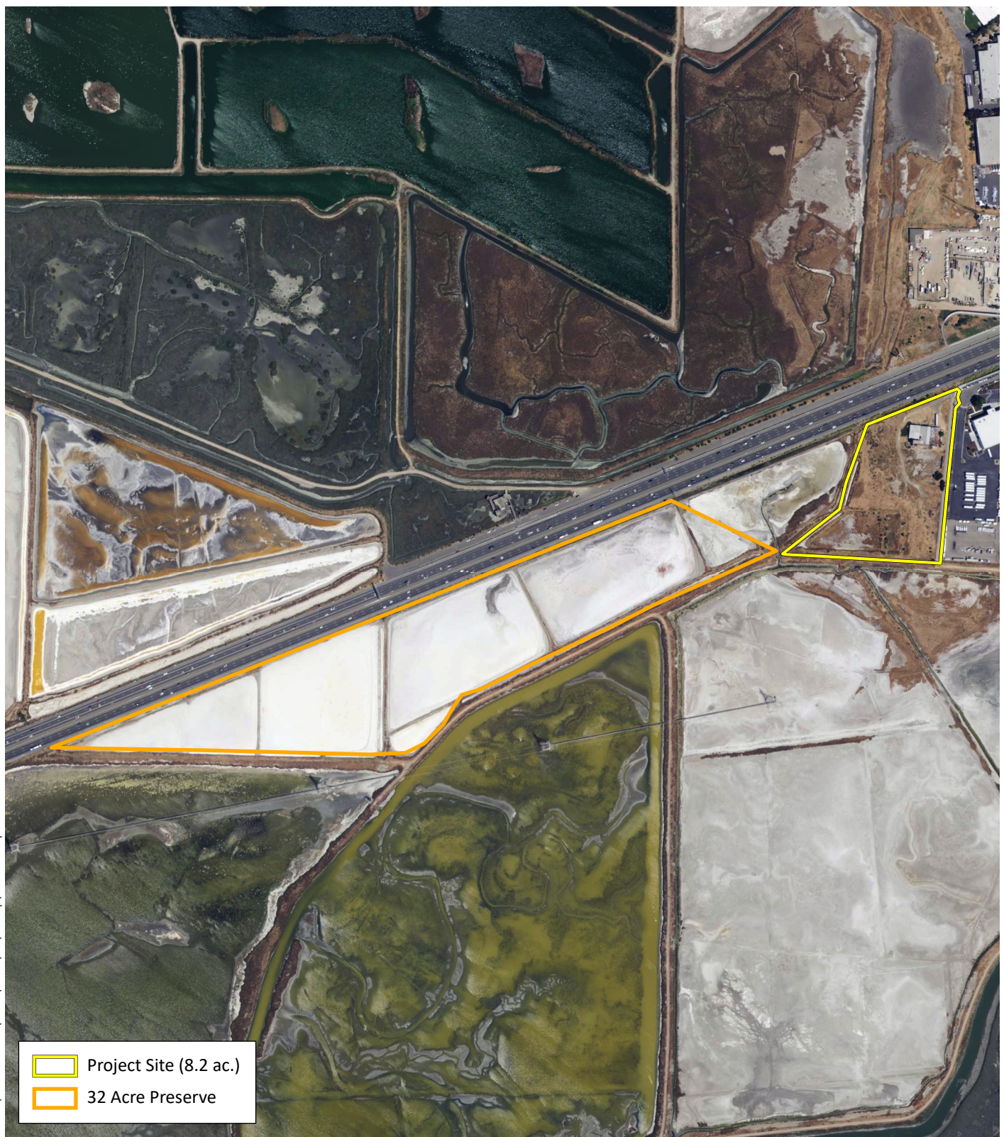
Prepared By: pkobylarz, 6/30/2020