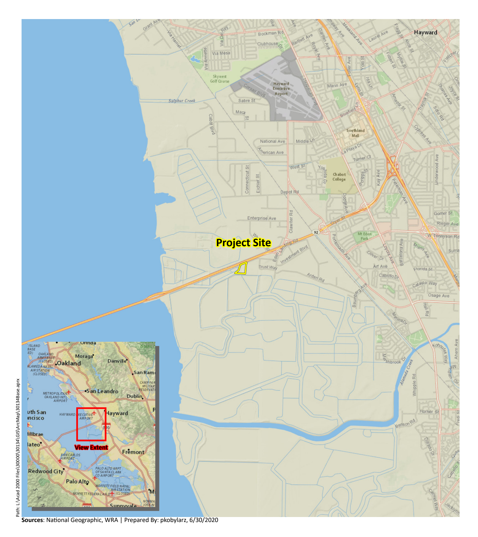
Figure 1. Project Area Location

U-Haul Point Eden Project Hayward, California