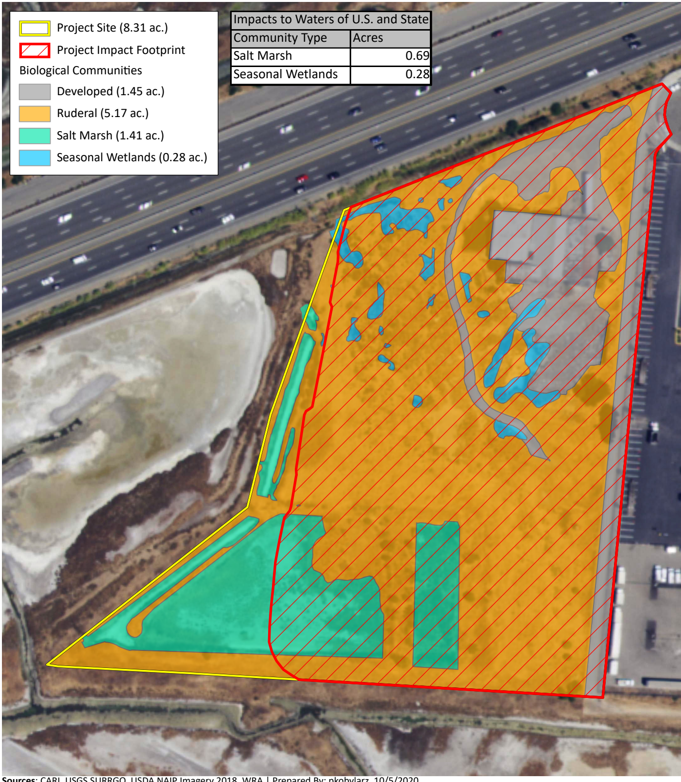
Sources: CARI, USGS SURRGO, USDA NAIP Imagery 2018, WRA | Prepared By: pkobylarz, 10/5/2020