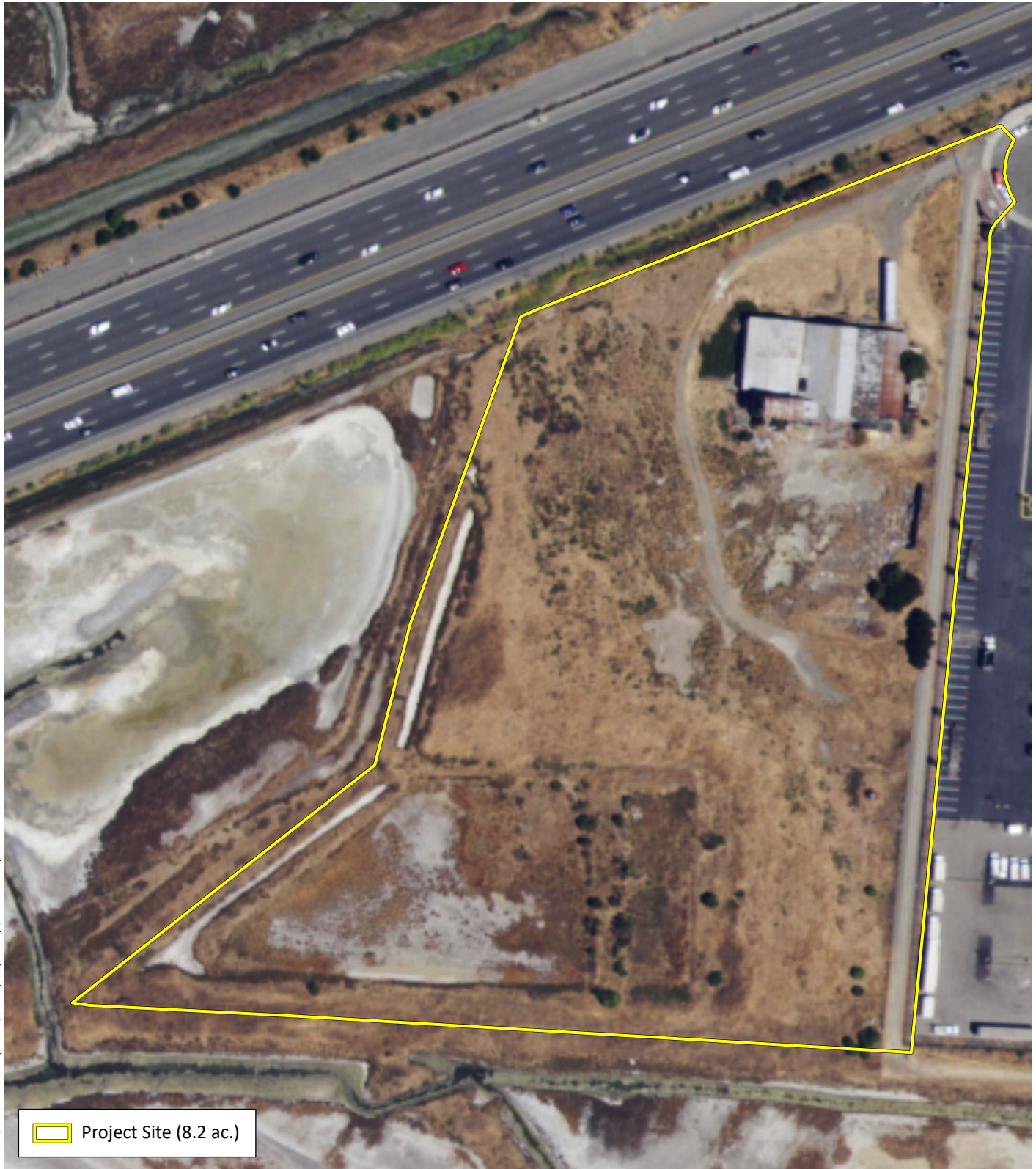
Sources: USDA NAIP Imagery 2018, WRA | Prepared By: pkobylarz, 6/30/2020