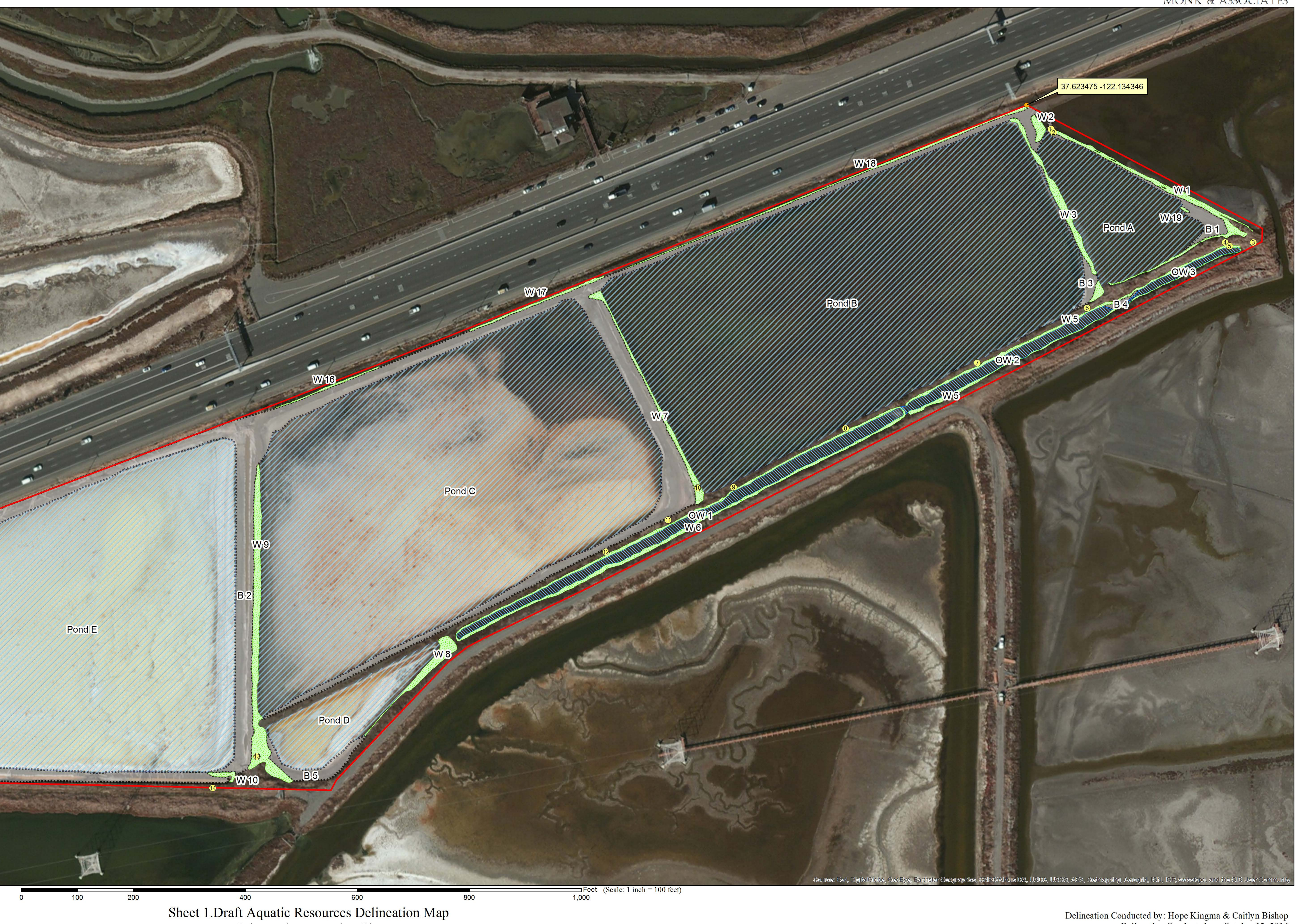
Sheet 1.Draft Aquatic Resources Delineation Map Salt Pond Restoration Site Point Eden, Hayward, California

Monk & Associates Environmental Consultants 1136 Saranap Avenue, Suite Q Walnut Creek, California 94595 (925) 947-4867