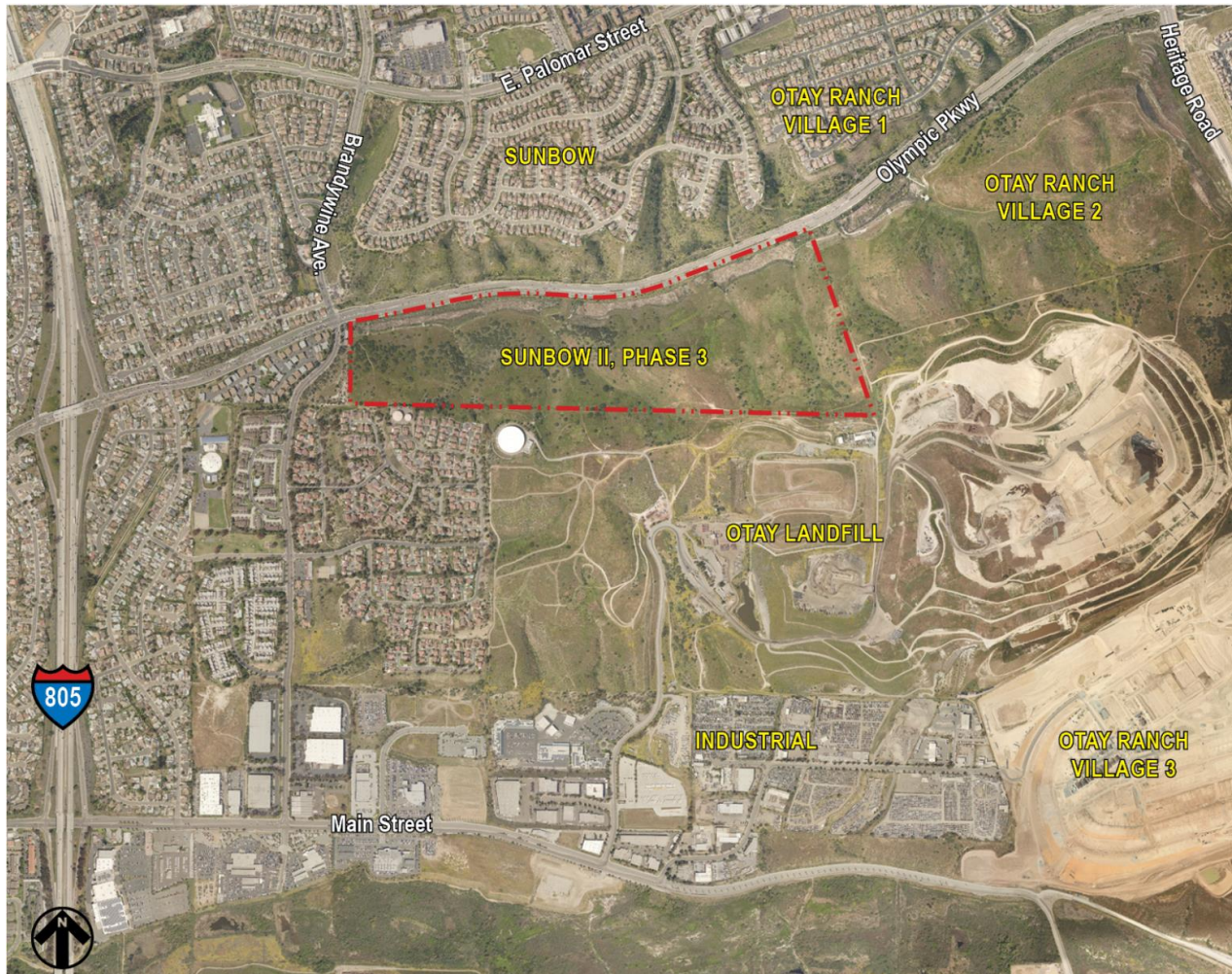
Figure 1 Project Location