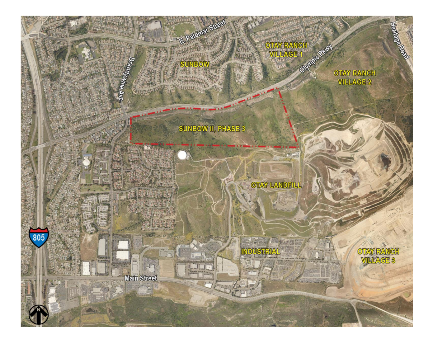
Figure 1 Project Location