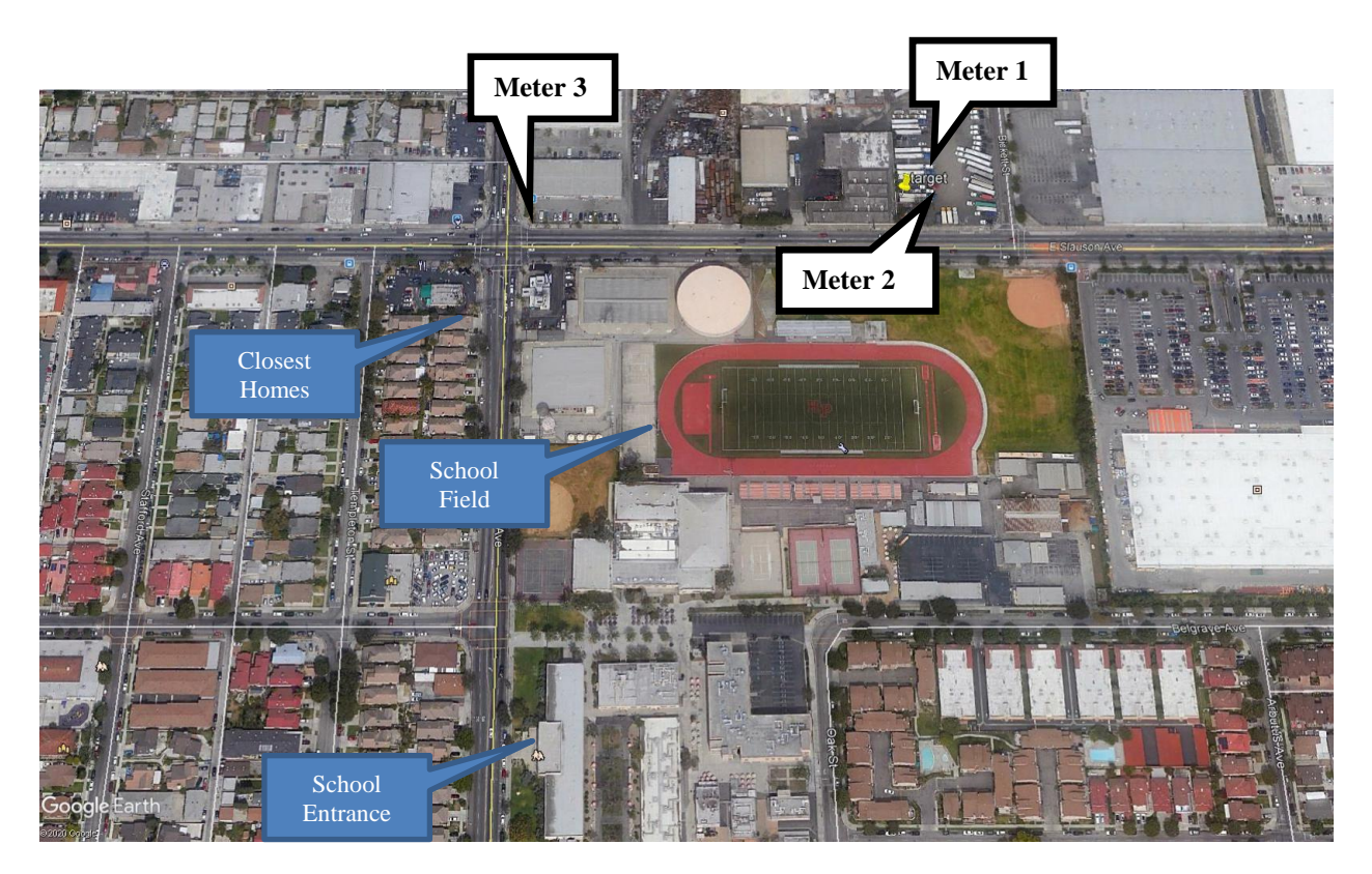
Figure 2 Noise Monitor Locations and Sensitive Use Locations