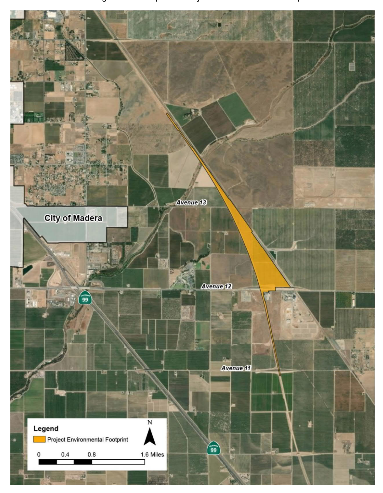
Figure 2-1. Proposed Project Environmental Footprint