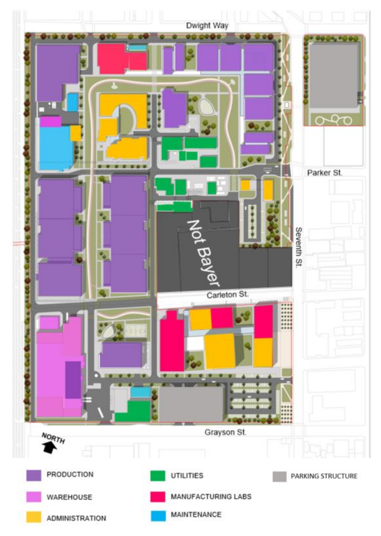
Figure 2: Conceptual Development Plan Build Out by Use at Year-30 (2052)