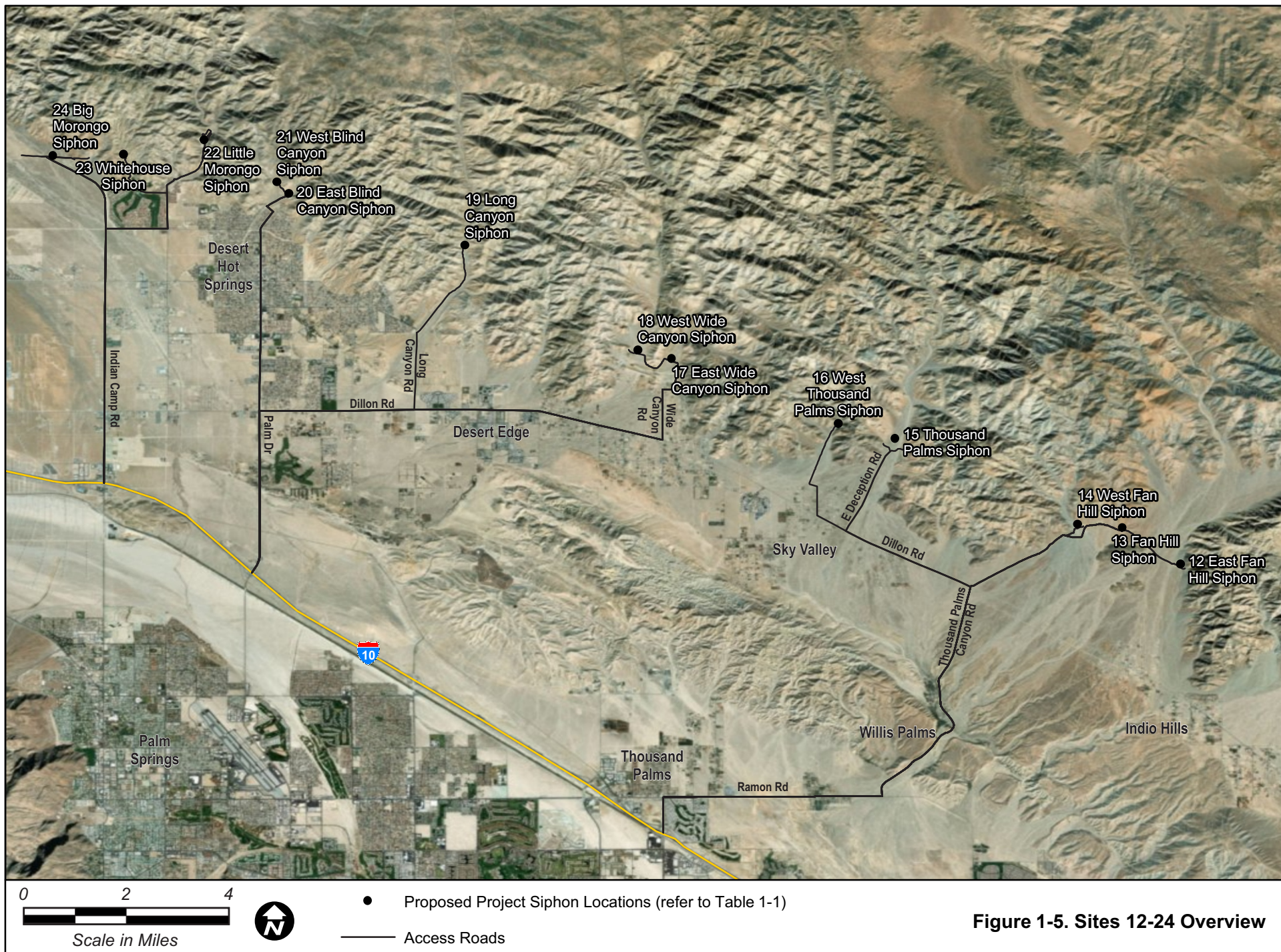
Figure 1-5. Sites 12-24 Overview