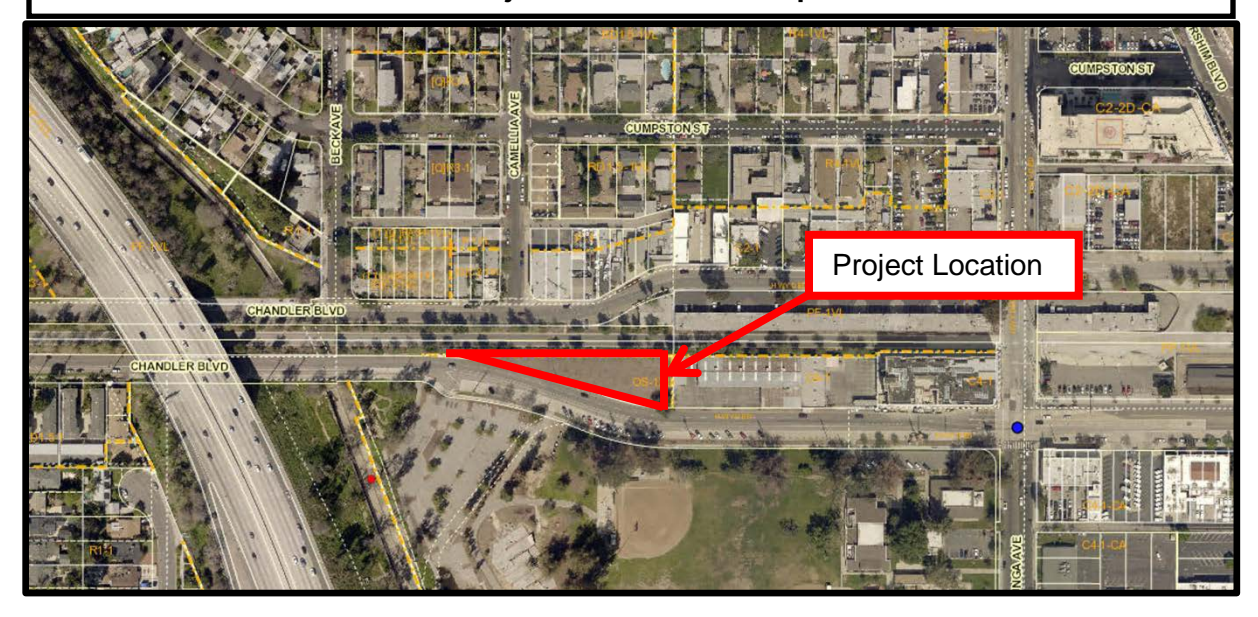
Figure 1 Project Site Location Map