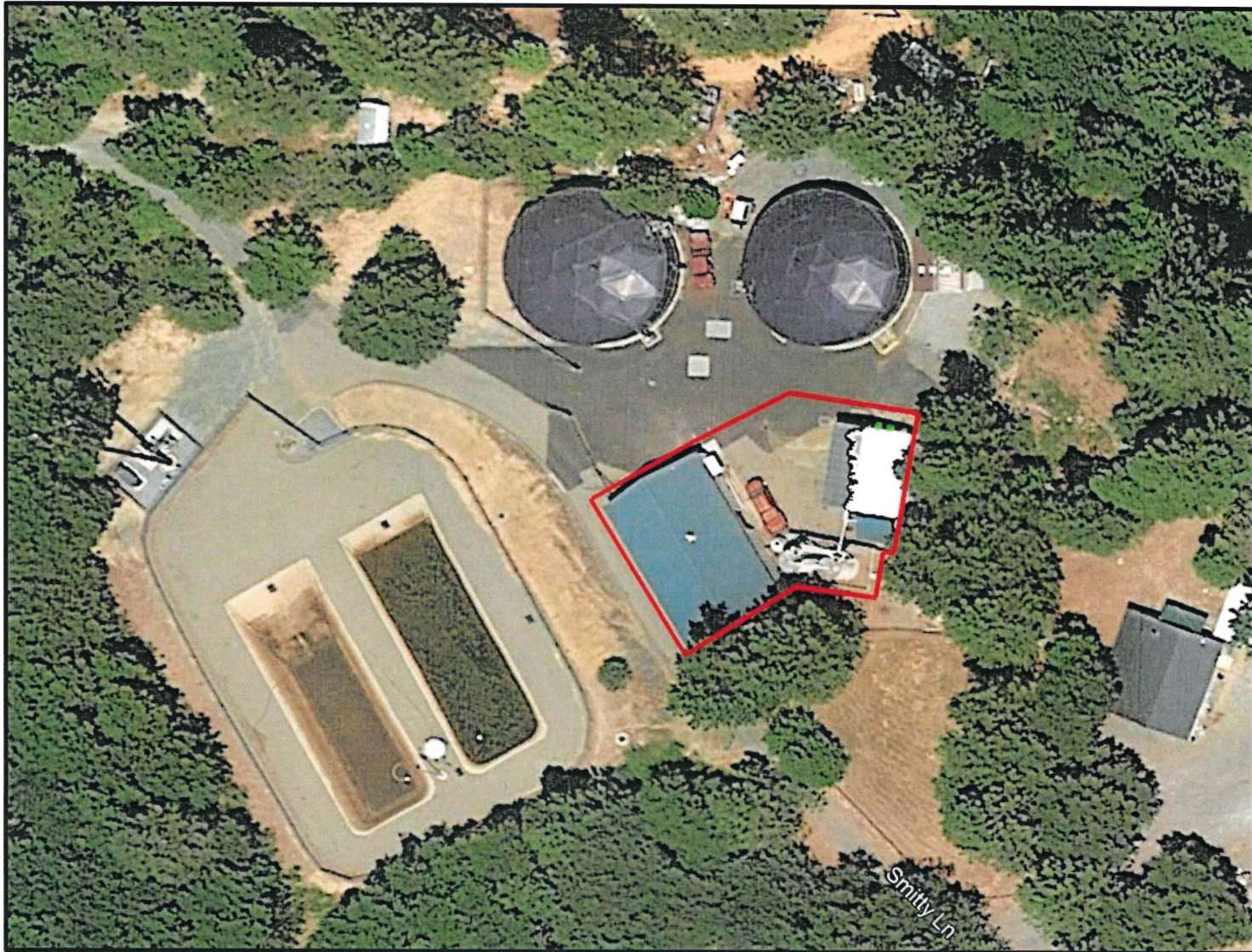
Calaveras County Water District, West Point Water Treatment Plant 481 Smitty Lane, West Point, CA 95255 Backup Filter Project / Area of Potential Effect (outlined in red)