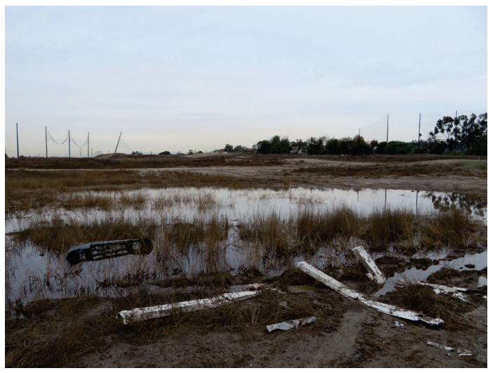
Photo 5: View looking northwest. The site has standing water from a recent storm event.