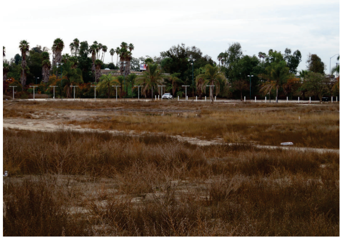
Photo 4: View looking south at the ruderal vegetation in the forgeround and ornamental landscaping associated with the parking lot.