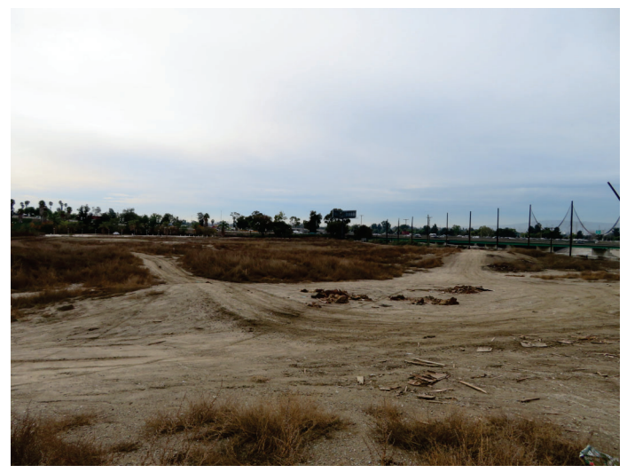
Photo 1: View looking south; off-road vehicle use adds to the disturbance and compaction of the project area.