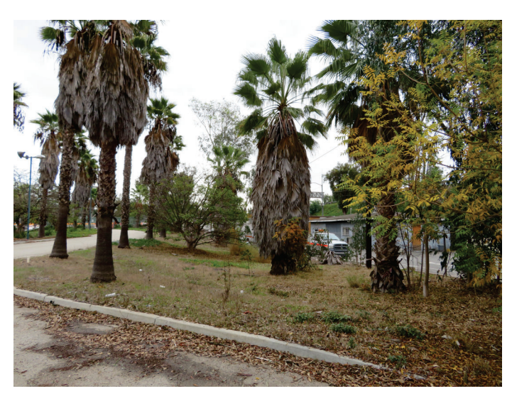
Photo 6: View looking east at the ornamental landscaping within the project area.