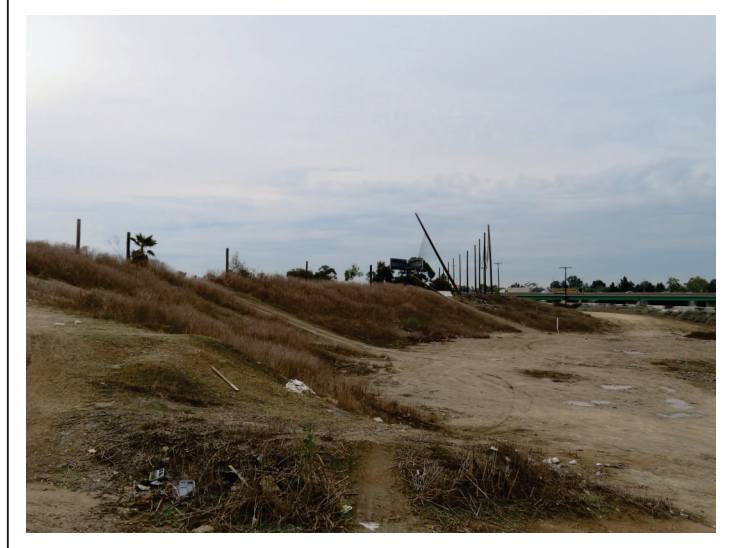
Photo 3: View looking east at the toe of slope of the infill soil mound; the disturbed slope edge is where the southern tarplant is found.