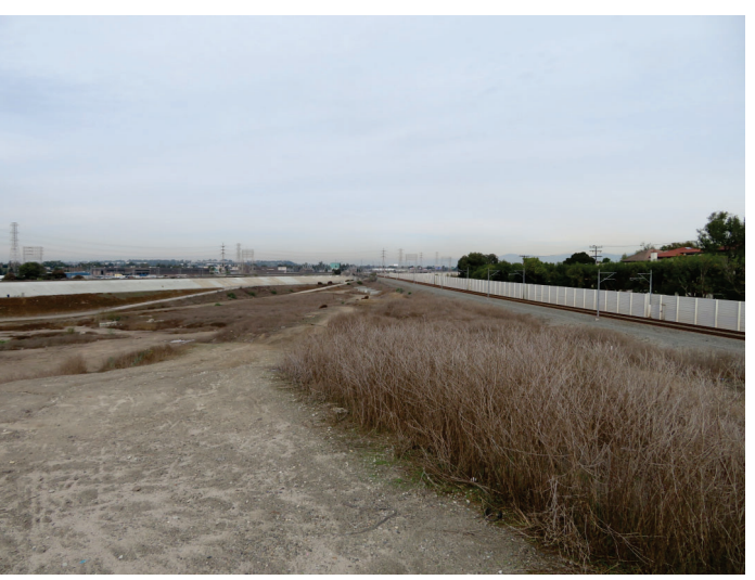
Photo 2: View looking north; nonnative vegetation dominates the disturbed soils that have not been compacted by vehicle use.