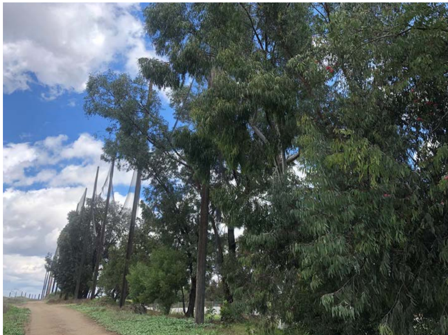
Representative site photograph taken from the eastern boundary of the project site, looking north.