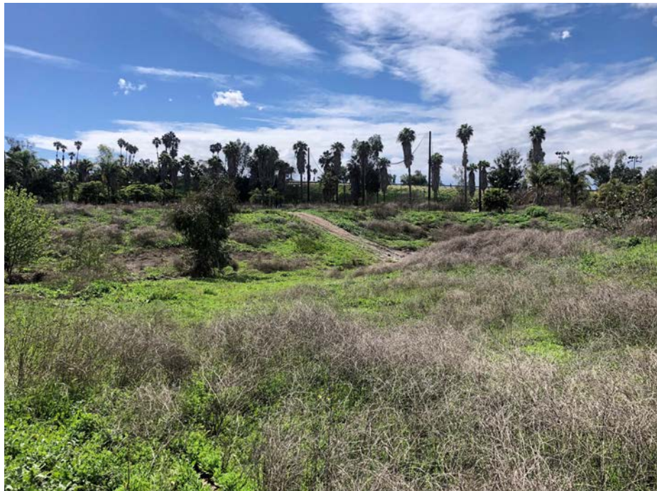
Representative site photograph taken from the northern portion of the project site, looking south.