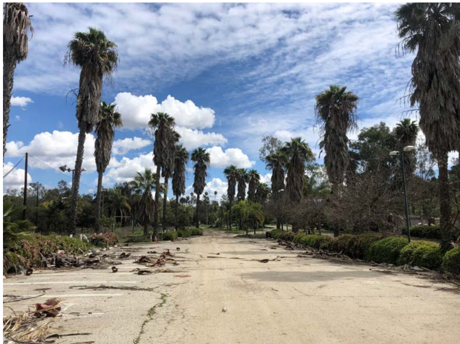
Representative site photograph taken from the western boundary of the project site, looking east.