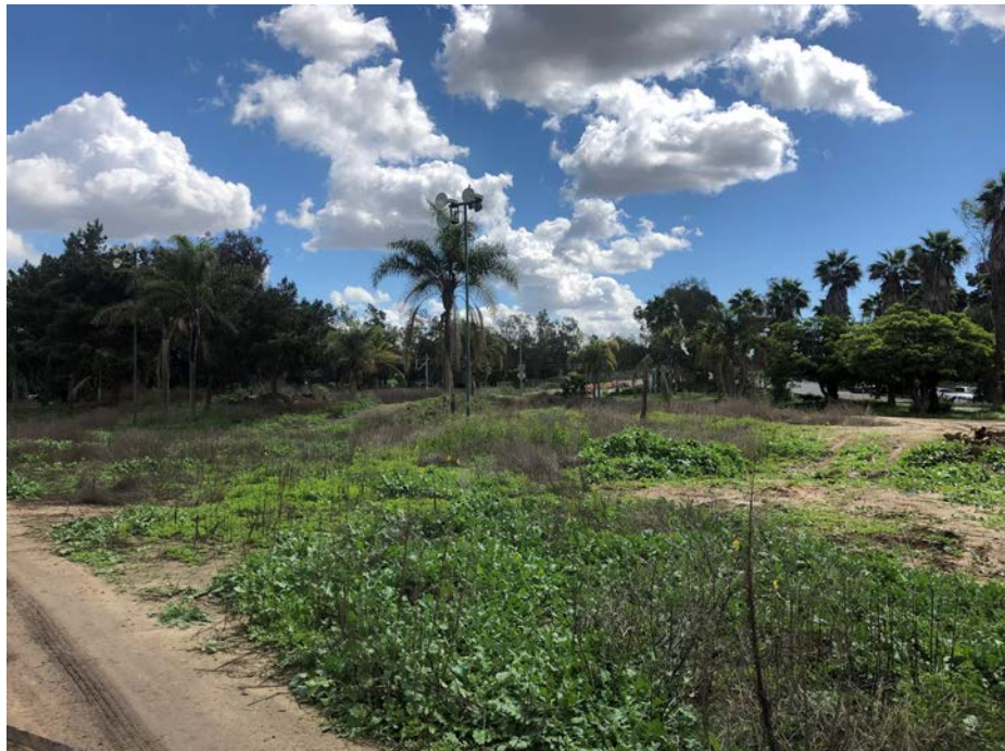
Representative site photograph taken from the central portion of the project site, looking southeast.