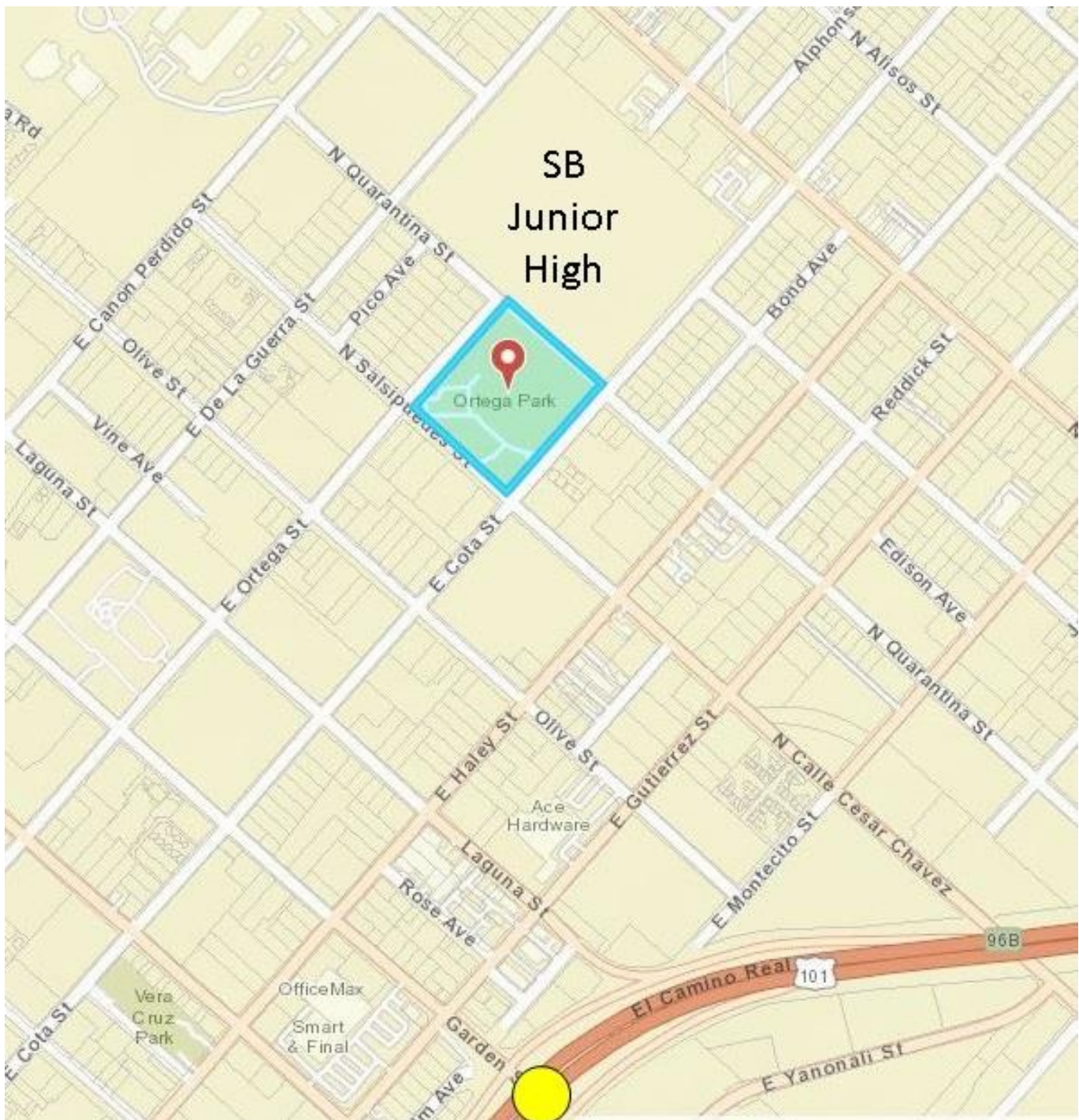
Figure 1: 604 East Ortega (Ortega Park, shown with blue parcel outline)

The project site is located at 604 East Ortega Street and is a 5.46-acre parcel (including the surrounding right-of-way; 4.71 acres for just the park interior) located in a mixed-use neighborhood. It is surrounded by Santa Barbara Junior High School to the north, single family residences to the west, and apartments and commercial units to the south and east. The nearest on-ramp to the 101 Freeway is approximately 0.6 miles south at Garden Street (on-ramp location shown with yellow circle on map above).