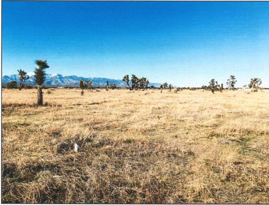
CENTER OF SITE LOOKING WEST