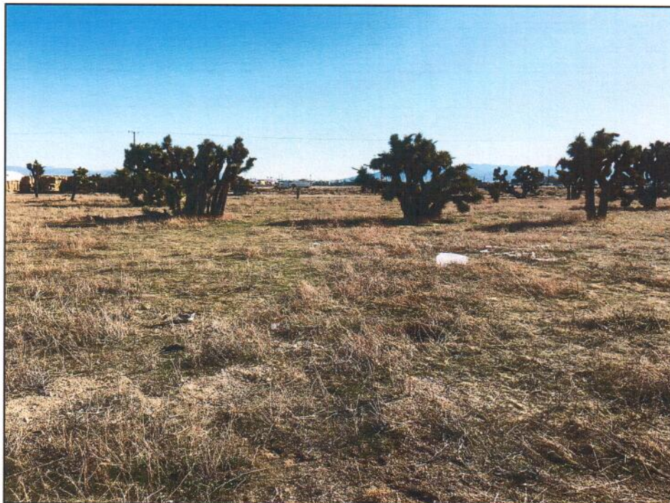
CENTER OF SITE LOOKING EAST