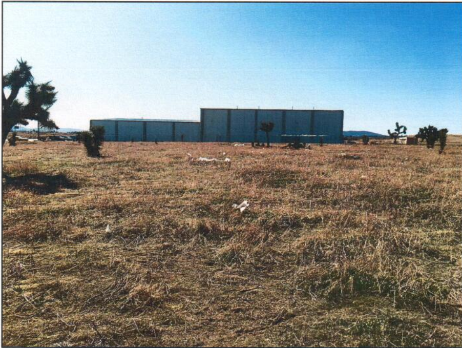
CENTER OF SITE LOOKING SOUTH