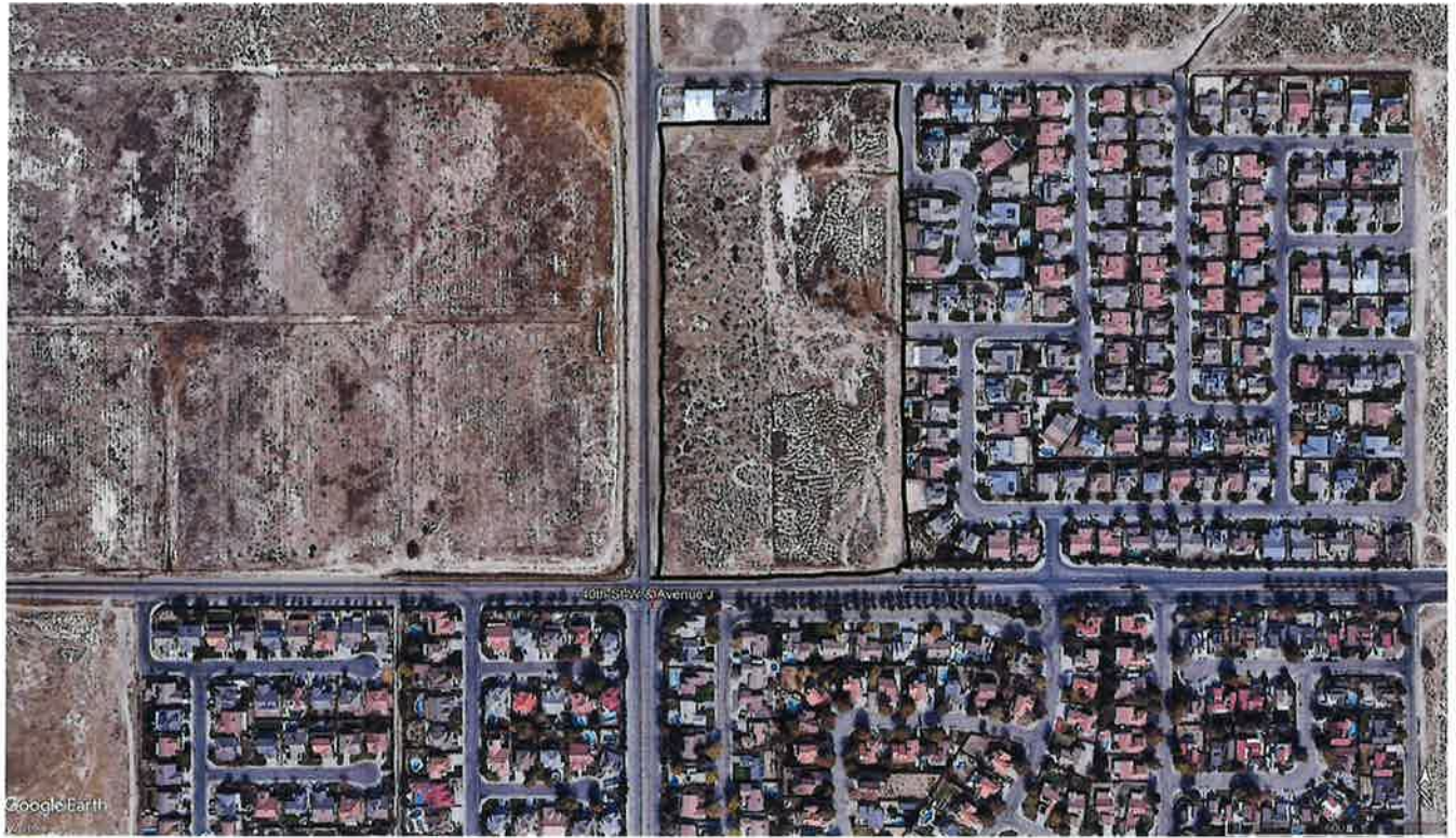
Figure 1, Project Location Map