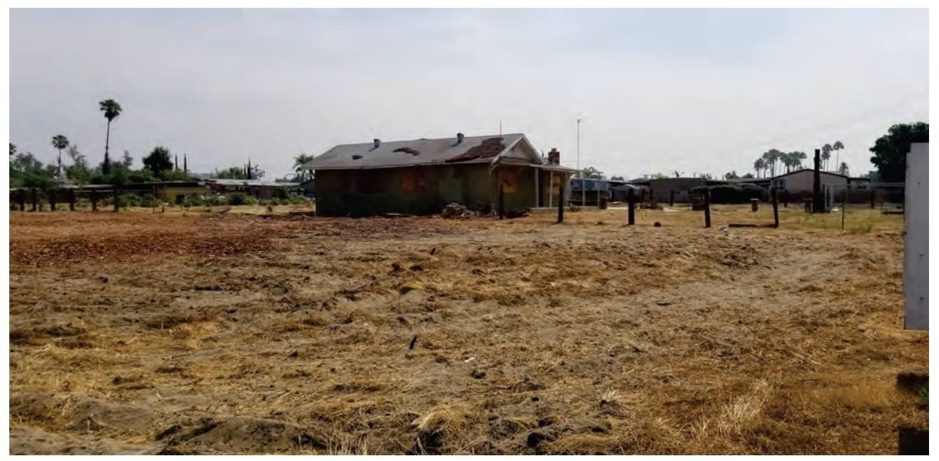
View of existing single-family residential building on the project site, looking east. June 24, 2020.