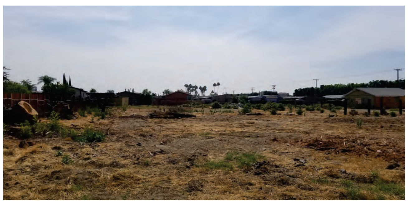
View of disturbed vegetation, looking east. June 24, 2020.