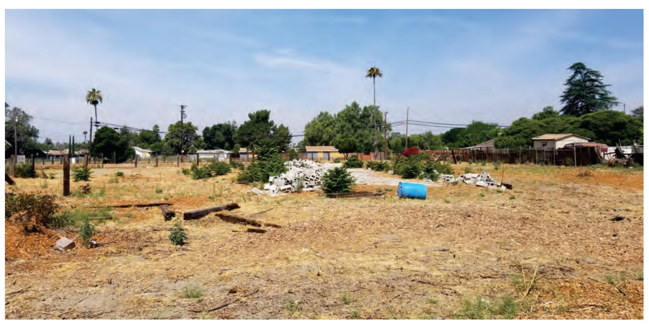
View of the concrete slab on the project site, looking west. June 24, 2020.