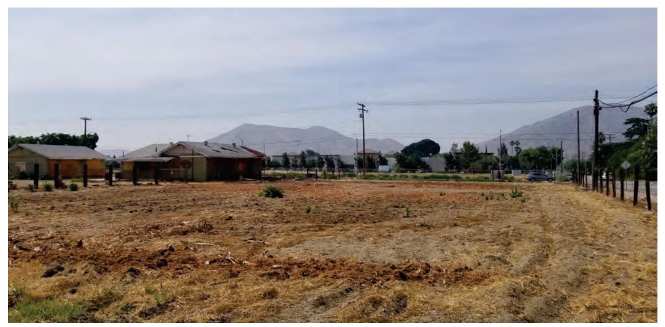
View of the property, looking south. June 24, 2020.