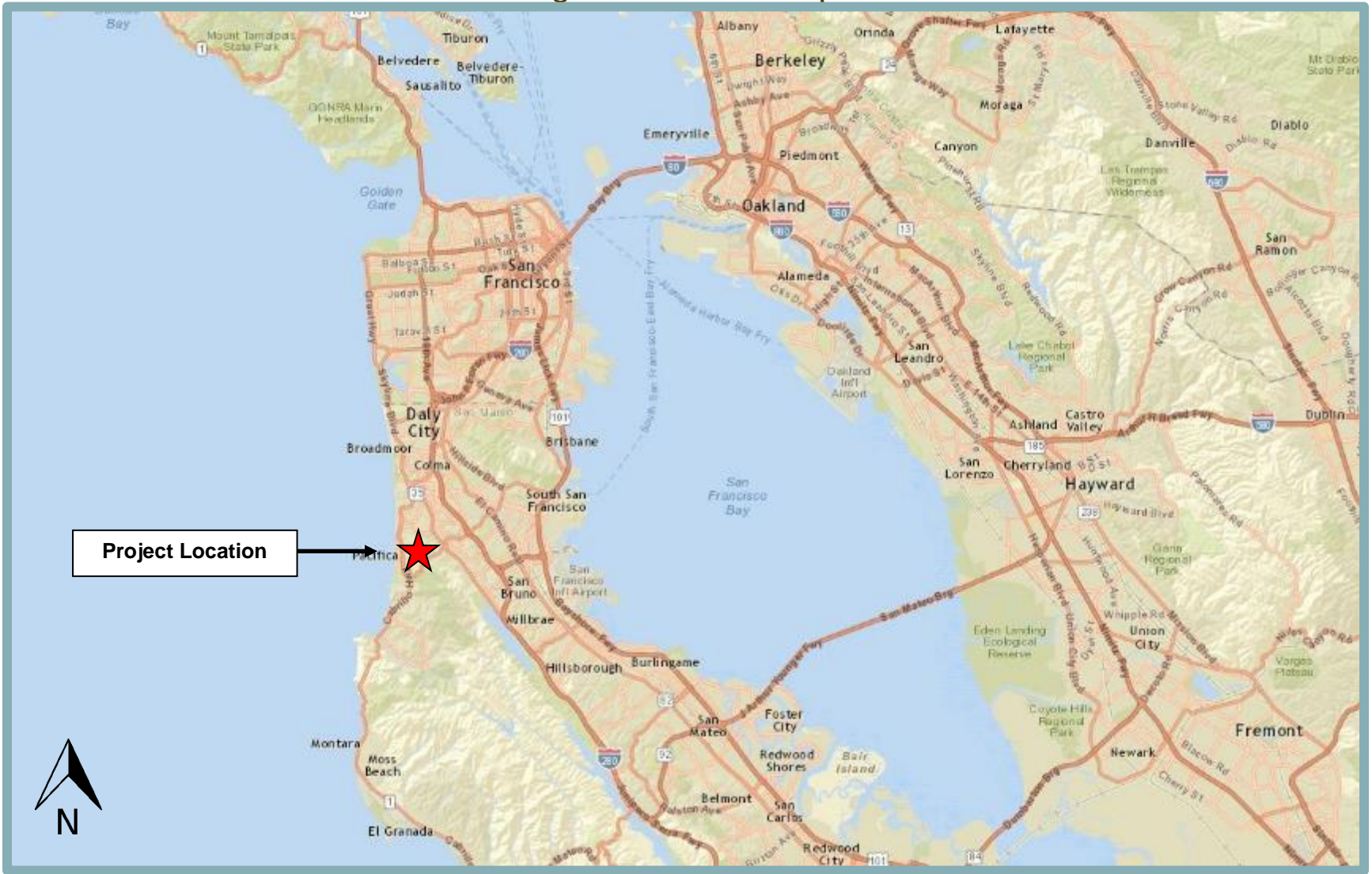
Figure 1 Regional Location Map