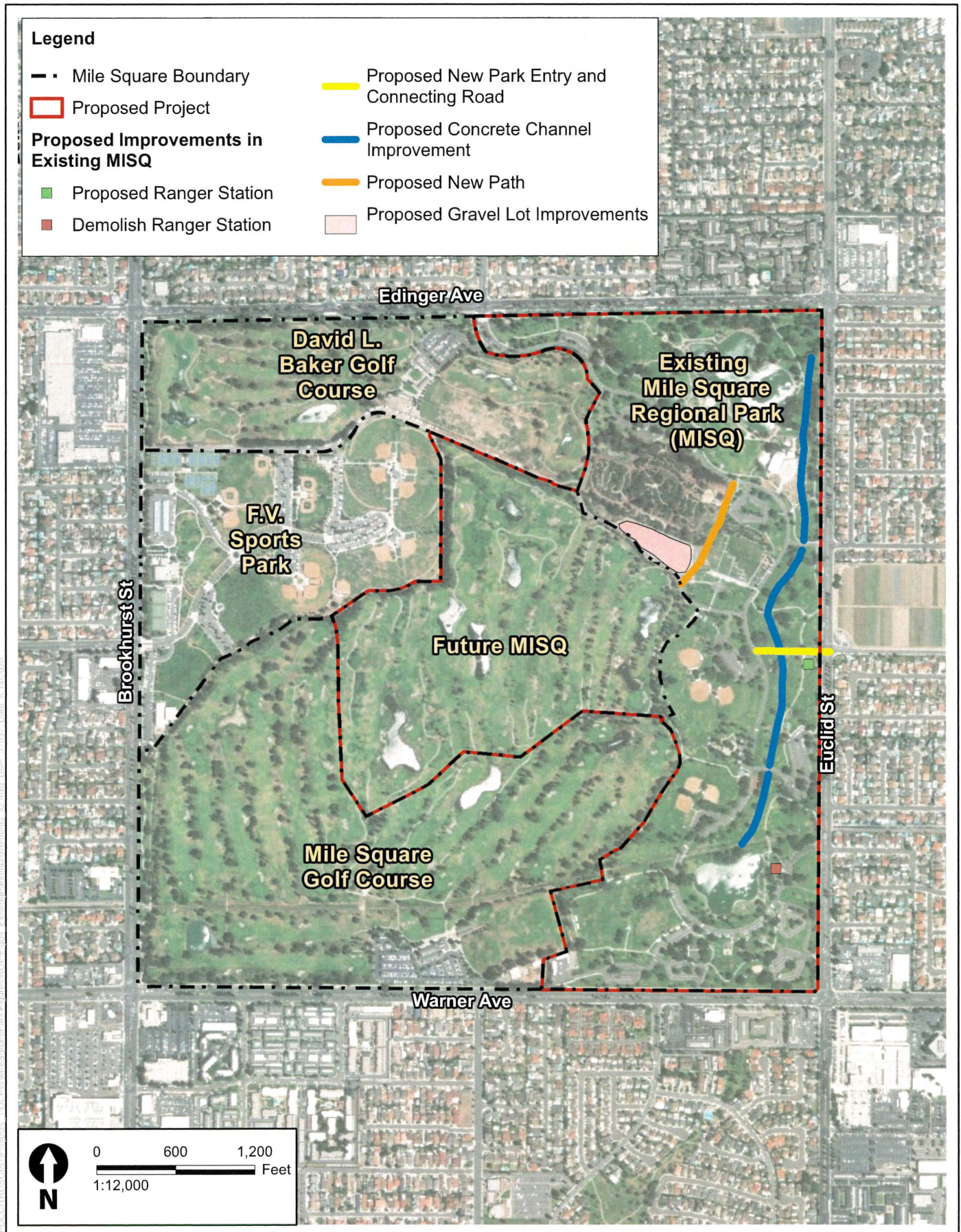
Figure 4 Proposed Improvements in Existing MISQ Mile Square Regional Park Master Plan