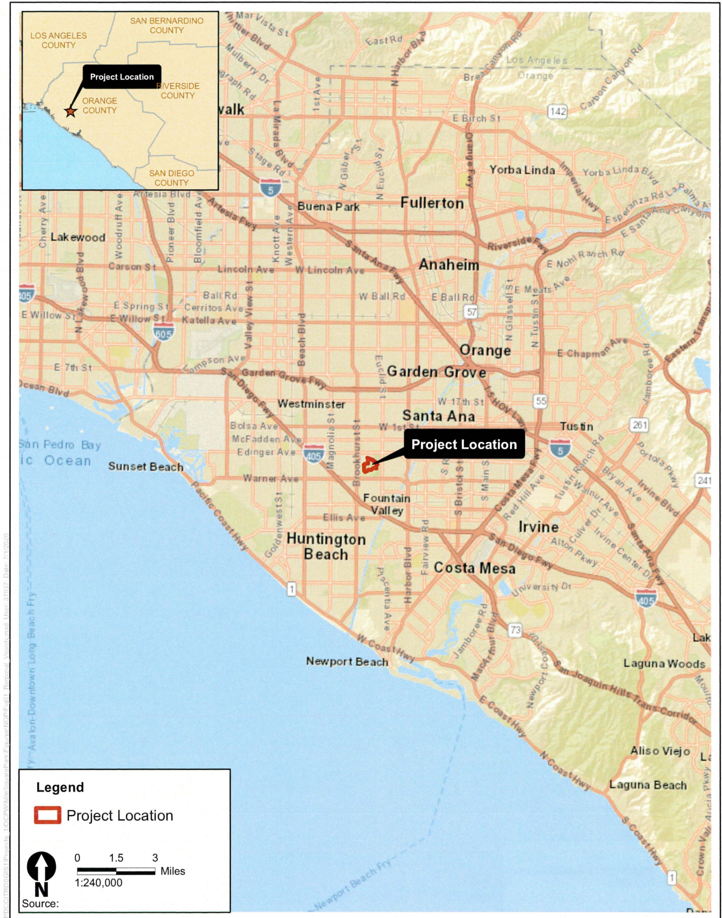
Figure 1 Regional Vicinity Mile Square Regional Park Master Plan