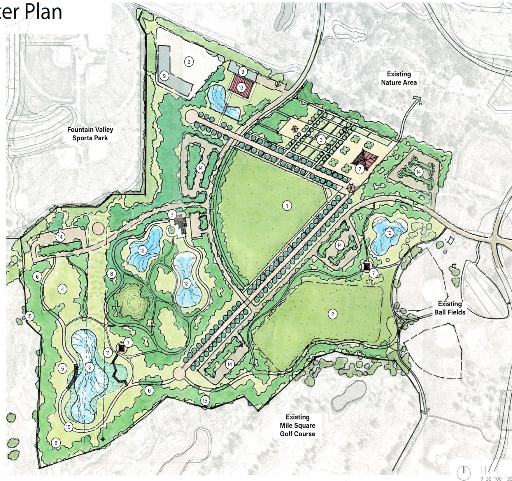
Figure 3 Conceptual Master Plan Mile Square Regional Park Master Plan