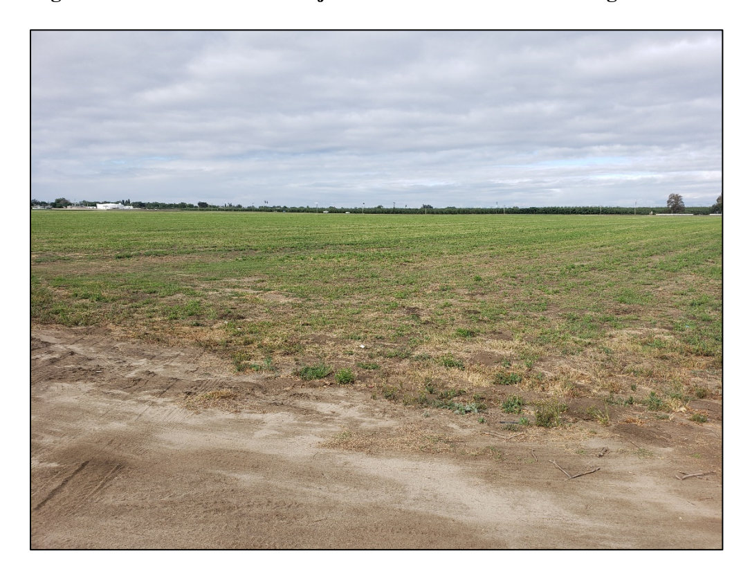
Figure 3. Overview of Project area after harvest at time of survey looking southwest.