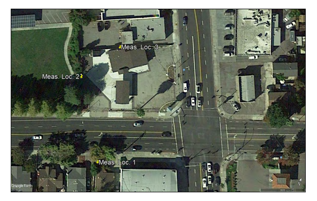
FIGURE 2- Noise Measurement Locations

The measurement locations are shown on Figure 2, below.