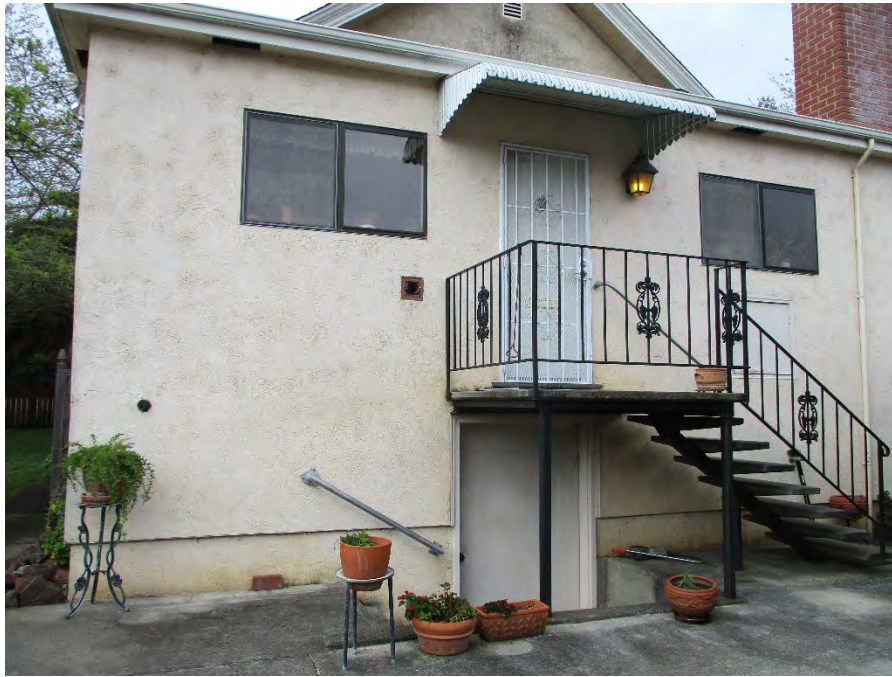
Figure 17. Photo showing the east elevation, facing west.