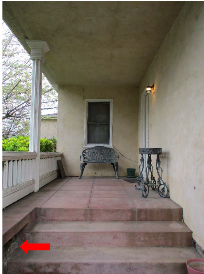
Figure 8. Photo of front porch showing the original stone along the red-colored concrete steps, facing east.