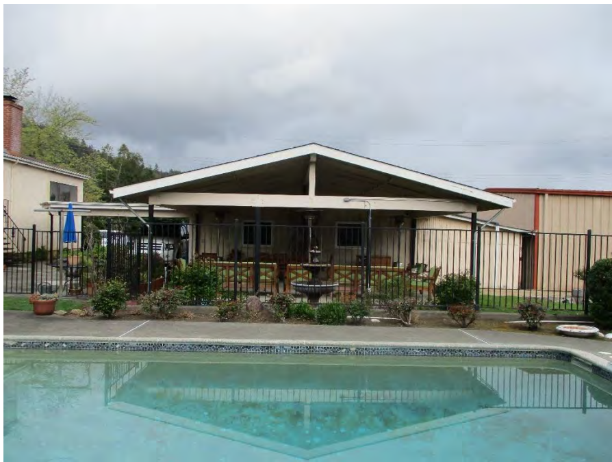
Photo showing the south façade, facing north.