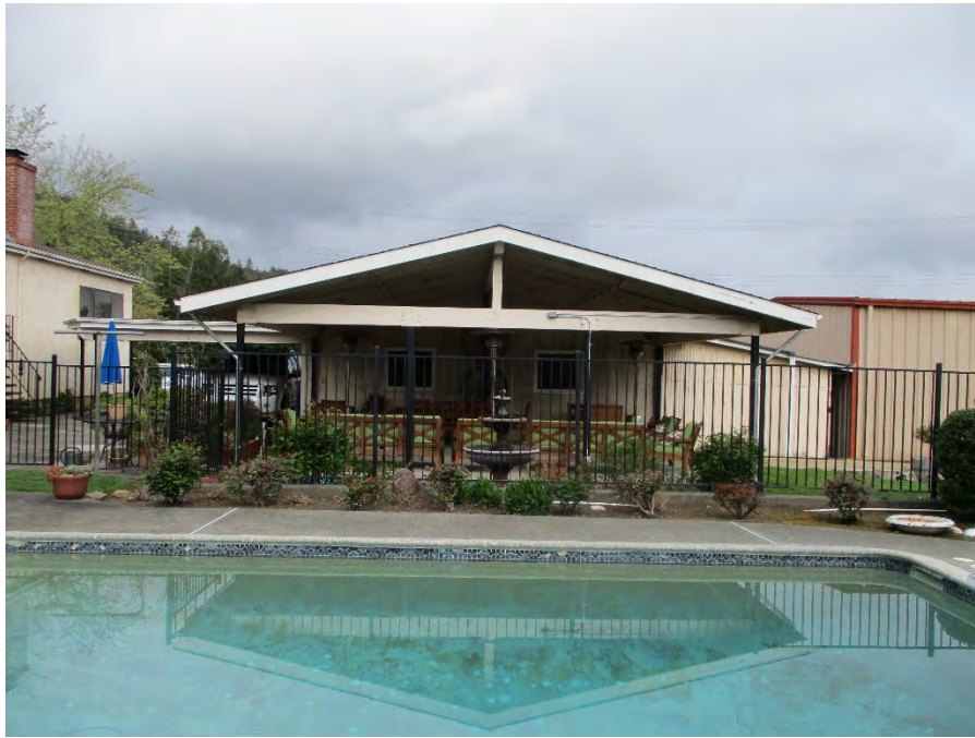
Figure 20. Photo showing the south façade, facing north.