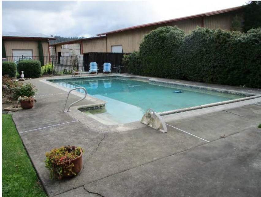
Photo showing the pool, facing south/southeast.

and a metal hand rail, and the other is a ledge for sitting. There is a diving board situated along the eastern side of the pool and a roll-up, vinyl pool cover placed along the western side of the pool. There are decorative turquoise and blue ceramic tiles that line the edge of the pool and vents for drainage. The pool is surrounded by concrete that is divided in sections and metal gate.