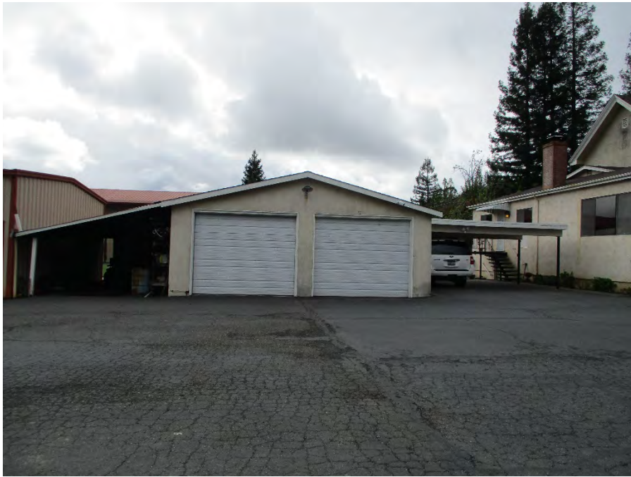
Figure 18. Photo showing the north elevation, facing south.