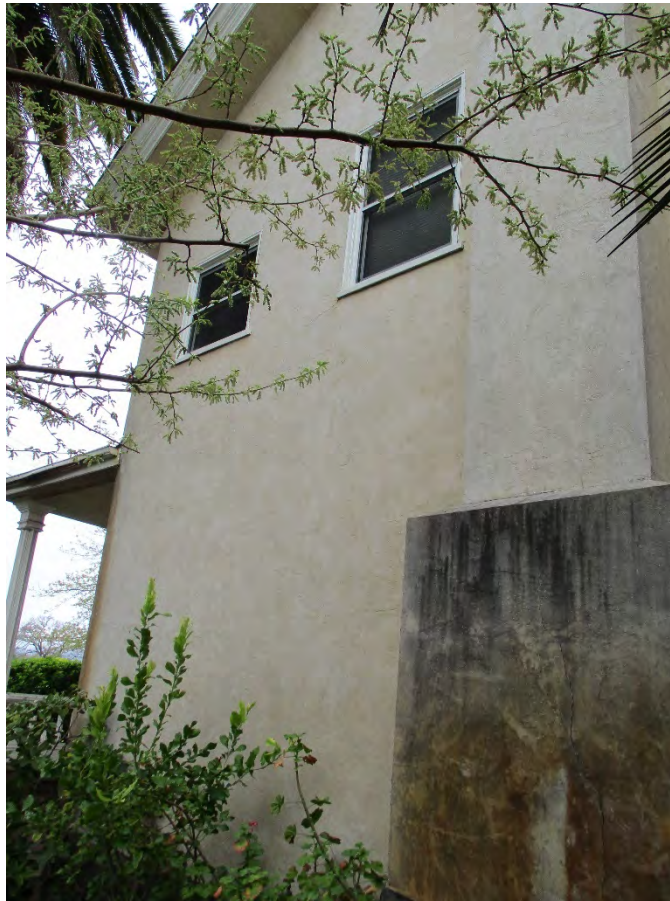
Figure 11. Photo showing the west elevation, facing east.