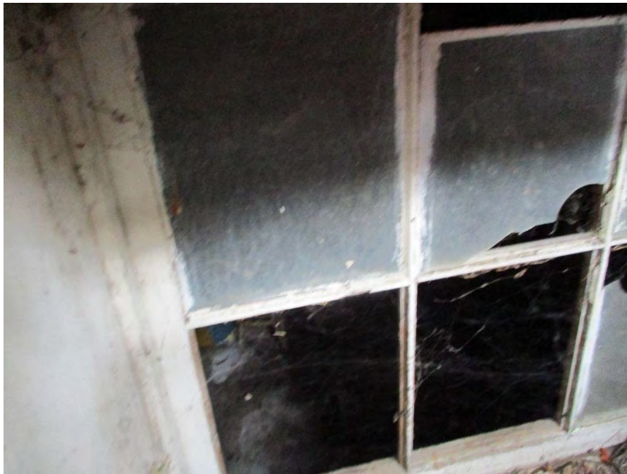
Photo showing the original multi-light basement window along the south elevation.