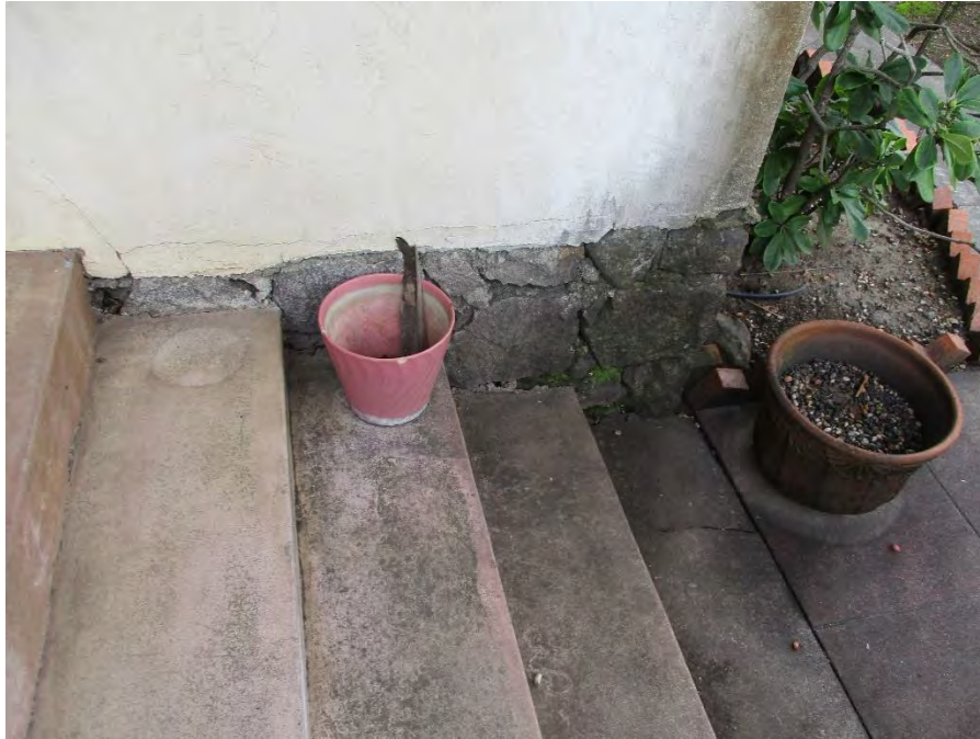
Photo of the foundation of the ca. 1880 house.