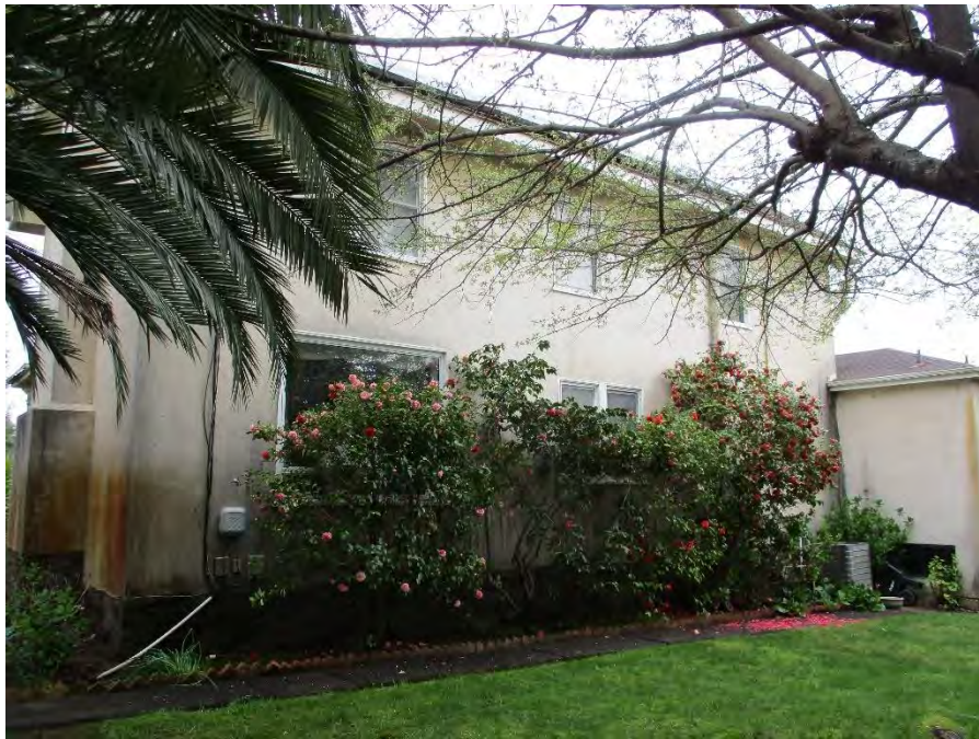
Photo showing the south elevation, facing north/northeast.

The south elevation consists of a combination of replacement vinyl windows, double-hung windows, a large single pane picture window, and aluminum sliding windows. There is also one original multi-light wood window, although covered with plywood that is present along the raised partial ground floor basement. The windows along the original portion of the house consist of simple wood casings and wood sills that do not appear to be original to the house and may have been altered during construction of the ca. 1955 addition; however, at least some of the window openings along this elevation have been altered, as shown by the presence of the picture window. The raised stone foundation and the ca. 1955 addition are also visible along this section. There are also pipes present along this elevation and staining and rust present on the stucco walls that is likely due to water drainage issues. There are also solar panels that are present and positioned along on the south-facing roof section of the house.