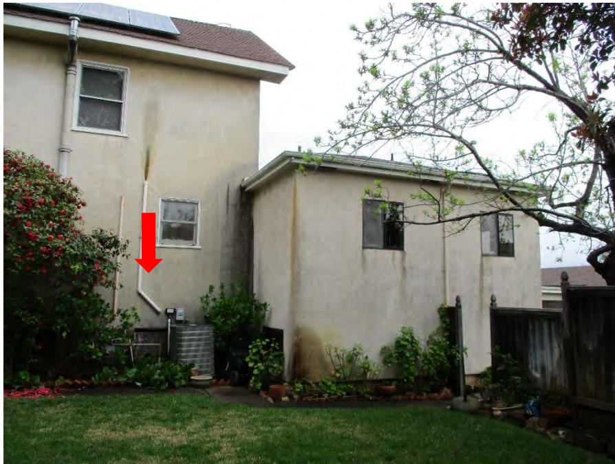
Photo showing the south elevation, facing north/northeast.