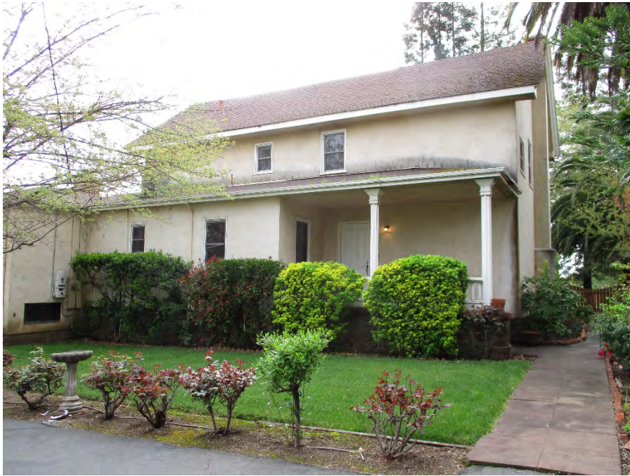
Figure 6. Photo showing north elevation, facing south.