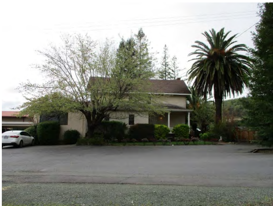
Photo showing north elevation, facing south.