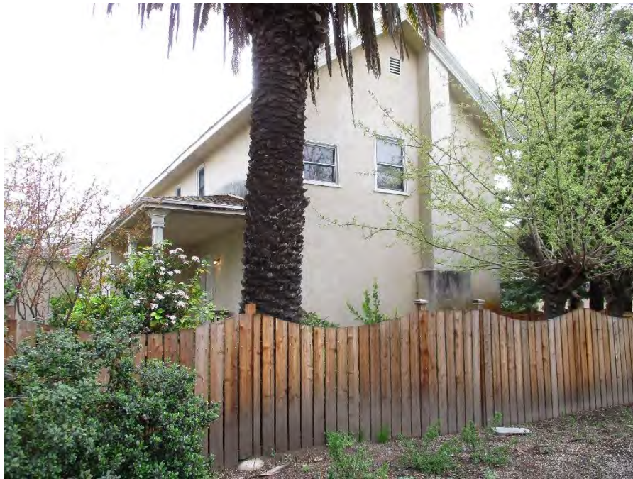
Photo showing the west elevation, facing south/southeast.