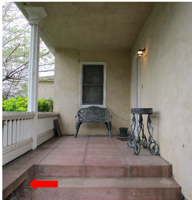
Photo of front porch showing the original stone along the red-colored concrete steps, facing east.