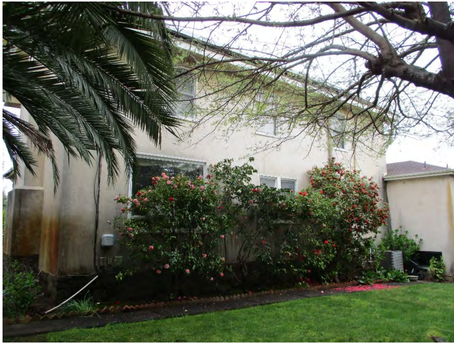
Figure 12. Photo showing the south elevation, facing north/northeast.