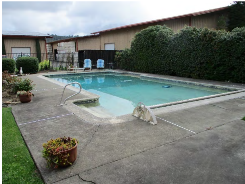
Figure 21. Photo showing the pool, facing south/southeast.

The ca. 1960 concrete inground pool is rectangular in shape and consists of two alcoves, one with steps and a metal hand rail, and the other is a ledge for sitting (Figure 21). There is a diving board situated along the eastern side of the pool and a roll-up, vinyl pool cover placed along the western side of the pool. There are decorative turquoise and blue ceramic tiles that line the edge of the pool and vents for drainage. The pool is surrounded by concrete that is divided in sections and metal gate.