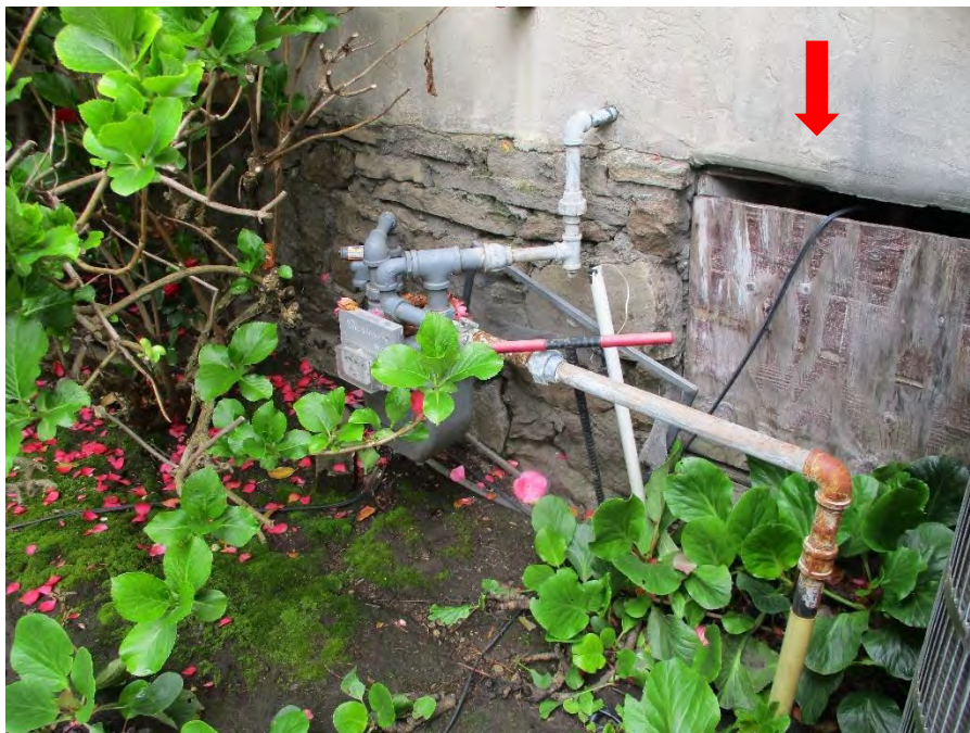
Photo showing the stone foundation, as well the boarded up basement window.