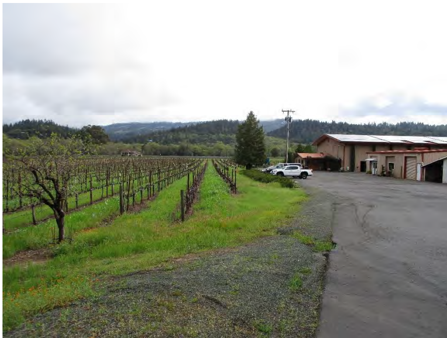
Photo showing the Ballentine vineyard and commercicla buildings, facing east.