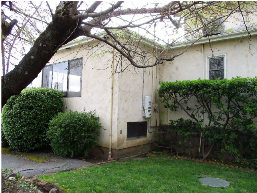
Figure 7. Photo showing north elevation addition, facing south.