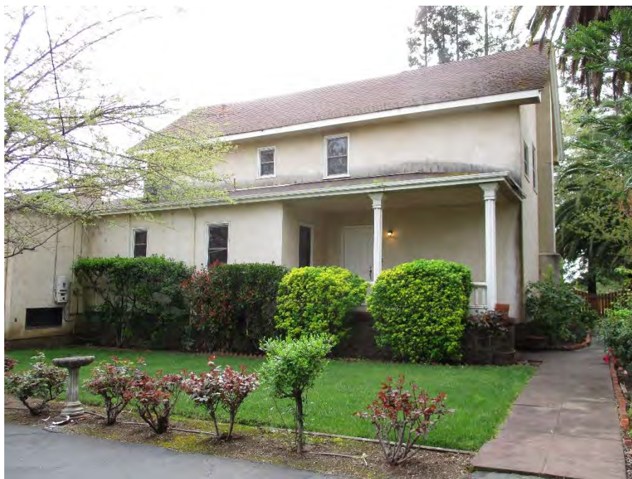
Photo showing north elevation, facing south