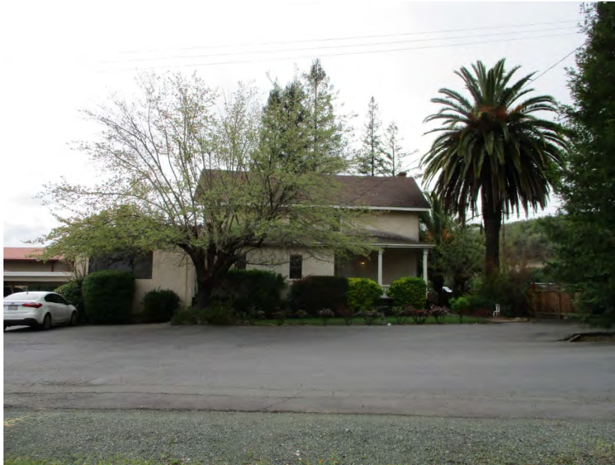
Figure 5. Photo showing north elevation, facing south.