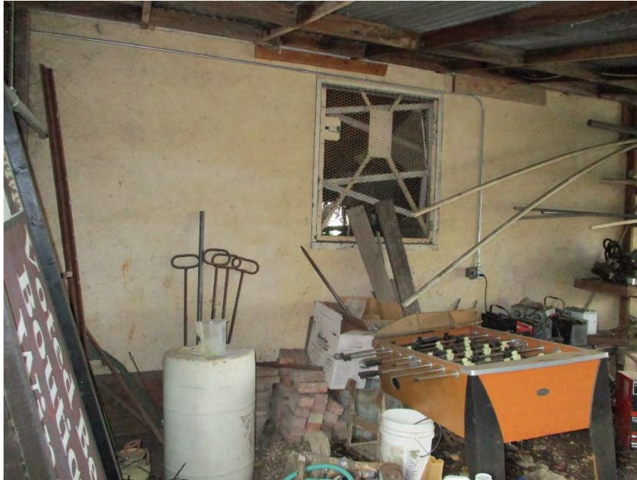
Photo showing the east elevation of the ca. 1945 garage, facing north/northwest.