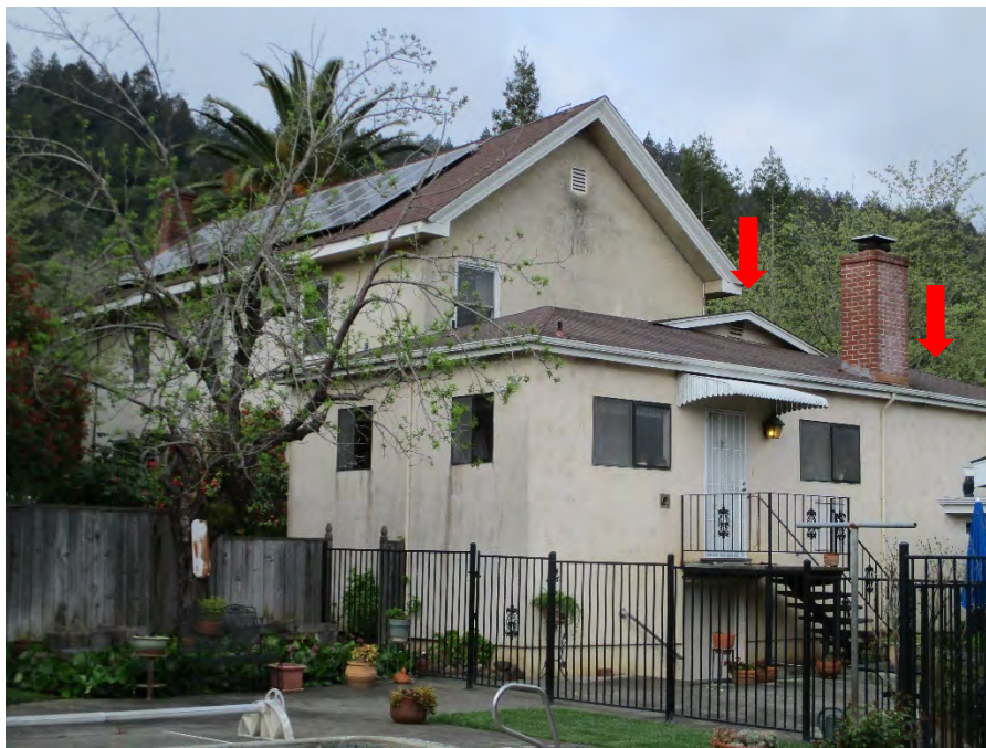
Figure 16. Photo showing the east elevation, ca. 1930 addition (left arrow), and the ca. 1955 addition (right arrow).

portion of the east elevation consists of a wrought-iron staircase with concrete steps that lead to a small landing supported by two metal posts, and another door (Figure 17). The door is a simple wood door with a diamond cut-out and a cut-out mailbox opening. There is also a metal screen door with decorative details and a metal awning that is original to the addition. There are also two metal sliding windows along the upper level that flank the door, along with a small square shaped door to the north; however, its purpose is not known. There is also a larger metal picture window along this elevation. None of the windows have wood casings. The raised foundation is also clad in stucco and is slightly recessed from the vertical plane of the addition. The original second-story gable of the ca. 1880 house is also visible along this elevation and includes a metal gable vent, and one double-hung vinyl window set within similar wood casing that is present along the north elevation of the original portion of the house.