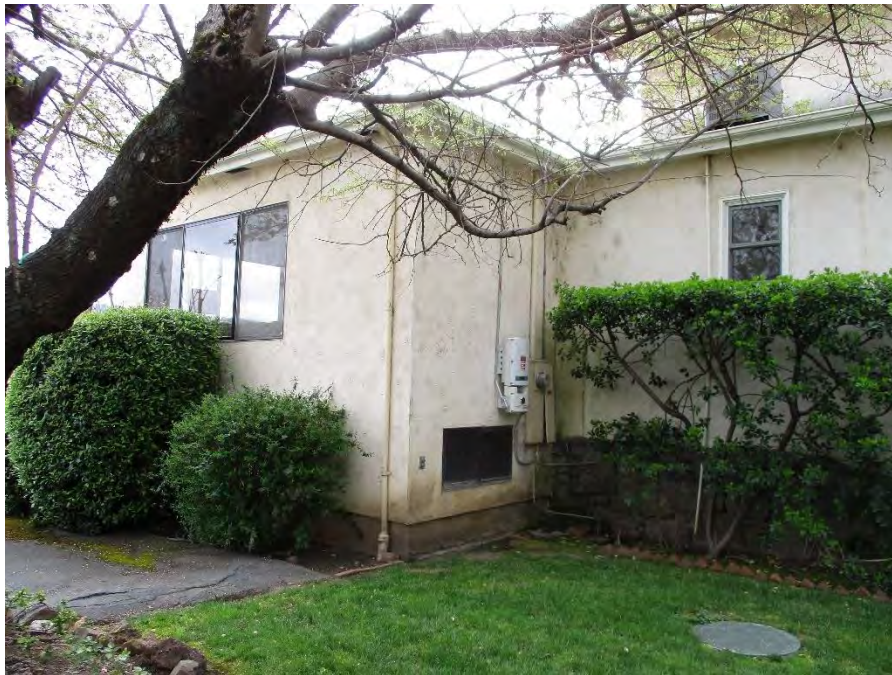
Photo showing north elevation addition, facing south