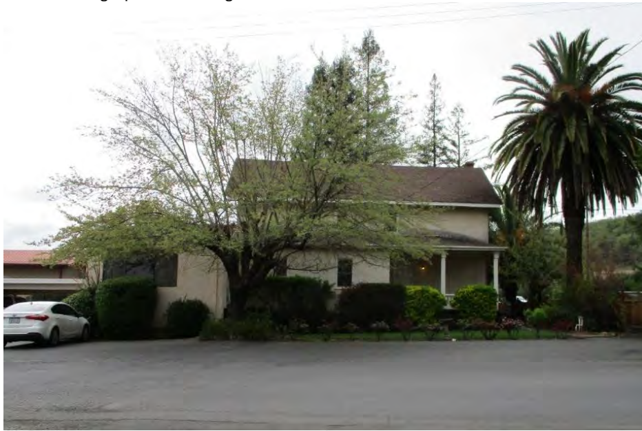
P5a. Photograph or Drawing

*P3a. Description: The ca. 1880 two-story house consists of a simple side-gable, and rectangular plan, which is consistent with Vernacular farmhouse types in the U.S. during the time the house was constructed. The house consists of a steep pitch side-gable roof that is clad in asphalt shingles, a raised stone foundation, partial-width front porch, and a modified exterior chimney at the side gable. There are what appear to be two additions that have been added to the house over time. There is an addition (ca. 1930) along the east elevation, which is hidden behind a second addition (ca. 1955), of which both are visible along the east elevation. The house is clad in stucco over original wood siding. The stucco along all elevations is showing signs of deferred maintenance that include cracks and rust stains from water draining down the exterior walls. (See Continuation Sheet, Page 2)