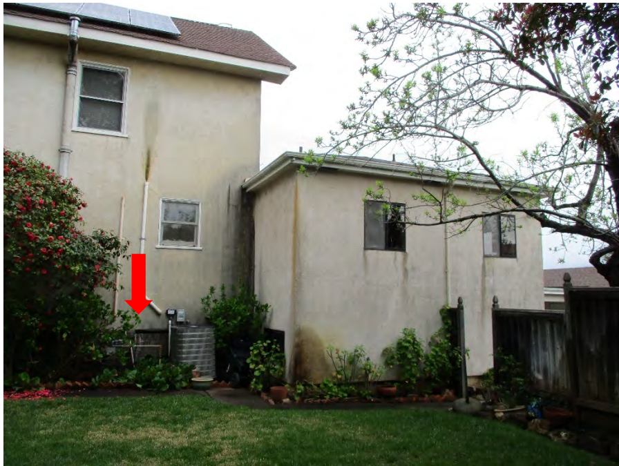
Figure 13. Photo showing the south elevation, facing north/northeast.