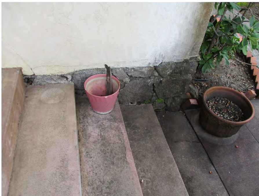
Figure 9. Photo of the foundation of the ca. 1880 house.