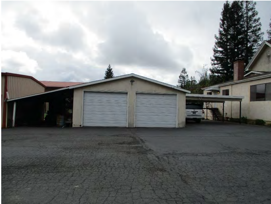
Photo showing the north elevation, facing south.

car garage. The building is a front gable, wood-frame structure that is clad in metal lath 1 and stucco over the original wood siding. The north elevation consists of roll-up, metal garage doors that were likely added in the 1980s. There is an open shed addition along the east elevation that is constructed of wood and is clad in corrugated metal sheet roofing. There is also a large window opening along the east elevation that is covered with a wire screen. The west elevation consists of a single-entry wood door and a window that matches the placement, size, and material of the east elevation window, which is a large window opening along the east elevation that is covered with a wire screen. There is also a flat-roof carport to the west of the garage that was likely added during the ca. 1955 alterations to the house. The south elevation consists of a patio with a wood porch awning with a low-pitched gable roof.