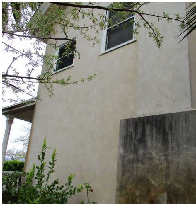
Photo showing the west elevation, facing east.