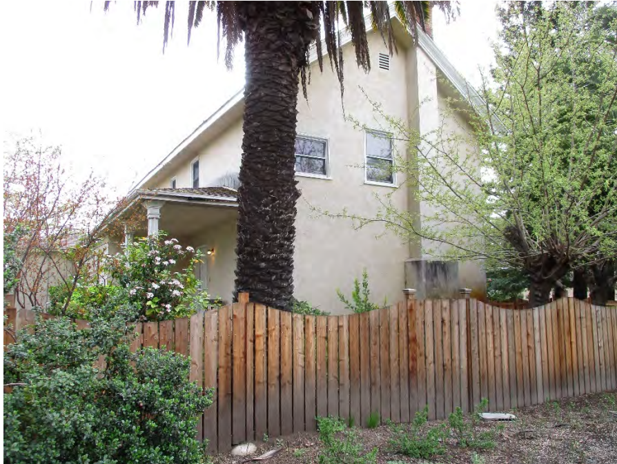
Figure 10. Photo showing the west elevation, facing south/southeast.

The west elevation consists of a stucco clad exterior walls and two replacement vinyl windows along the second story of the house (Figure 10). There is an exterior chimney that is a composite of masonry that includes stone and brick and is clad in sections with stucco. The upper portion of the chimney that is positioned through the narrow roof eaves shows the brick masonry. There is also a single, metal gable vent set within the gable. There is staining and rust present along this elevation that is likely due to water drainage issues (Figure 11).