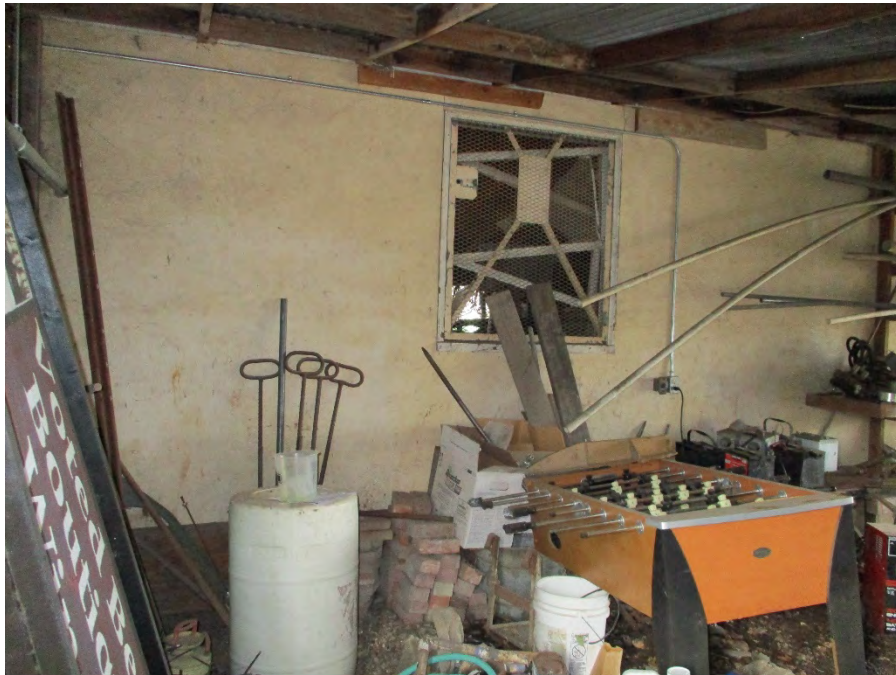
Figure 19. Photo showing the east elevation of the ca. 1945 garage, facing north/northwest.