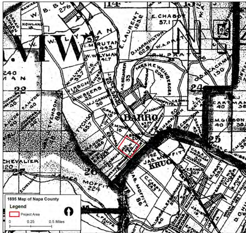
Figure 3: 1895 Buckman map of Napa County, showing the Project Area outlined in red.