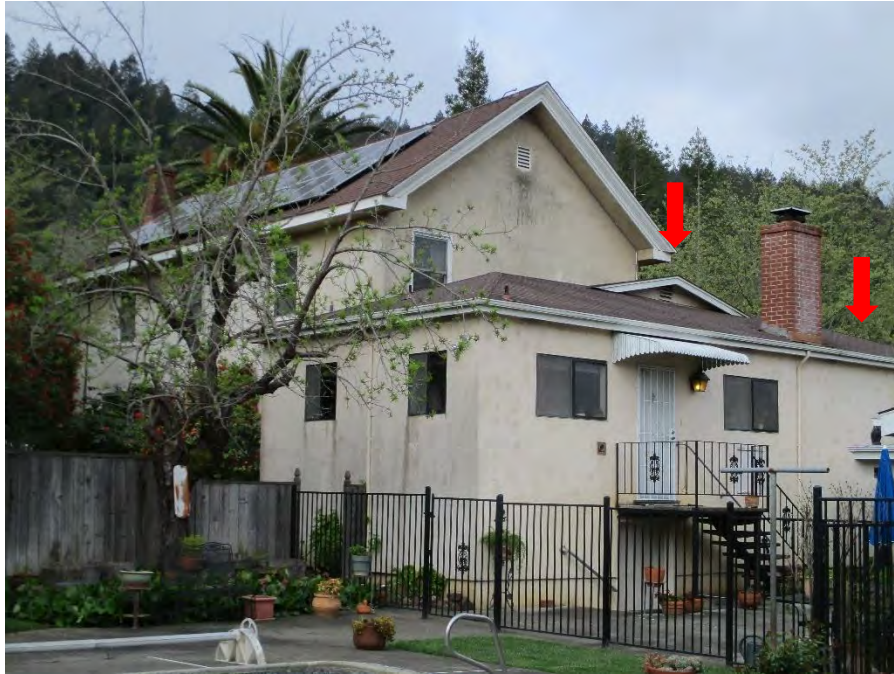
Photo showing the east elevation, ca. 1930 addition (left arrow), and the ca. 1955 addition (right arrow).