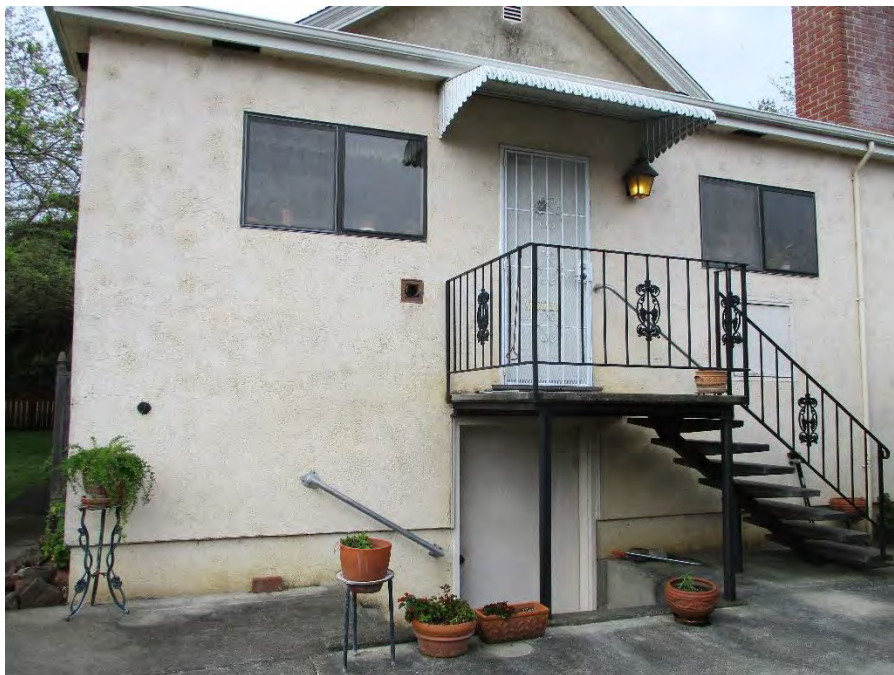
Photo showing the east elevation, facing west.