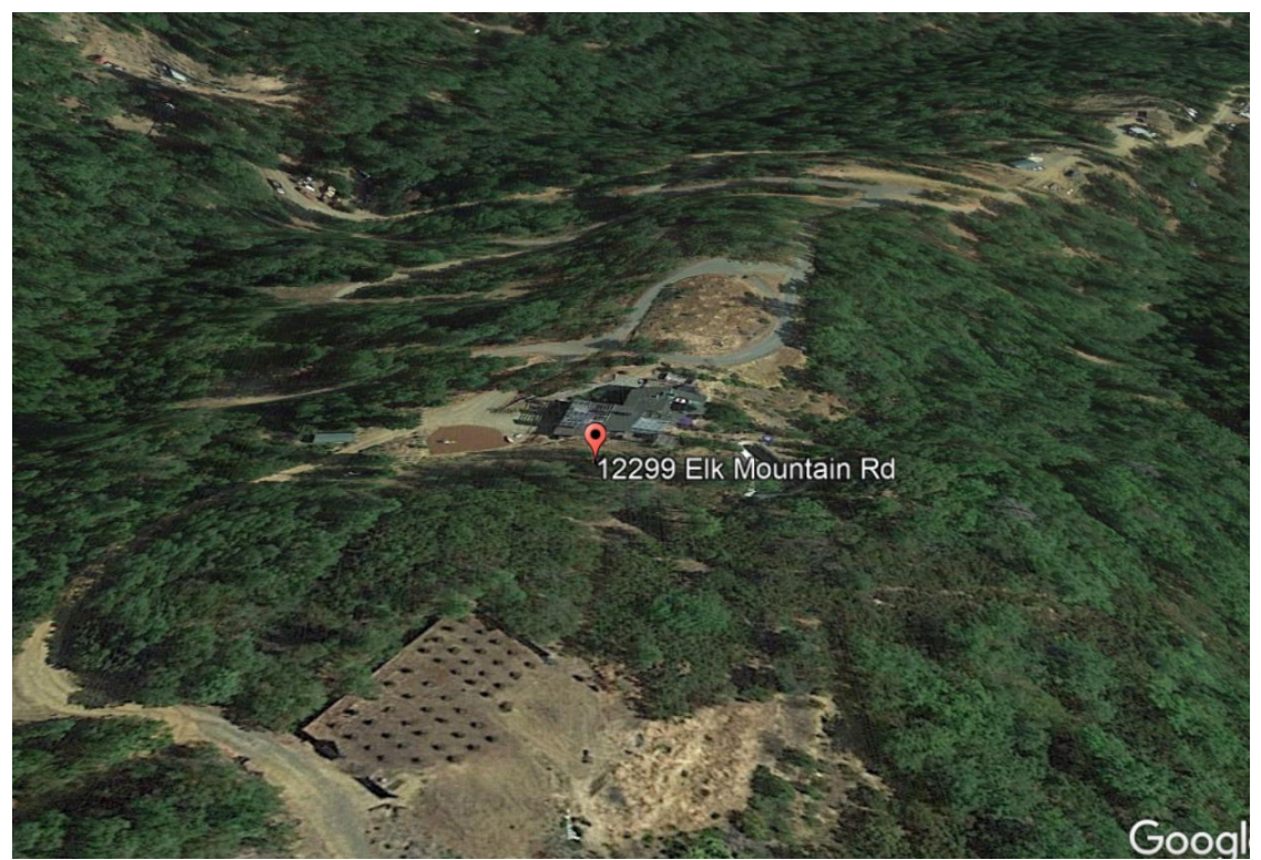
Aerial View of Site and Surrounding Land