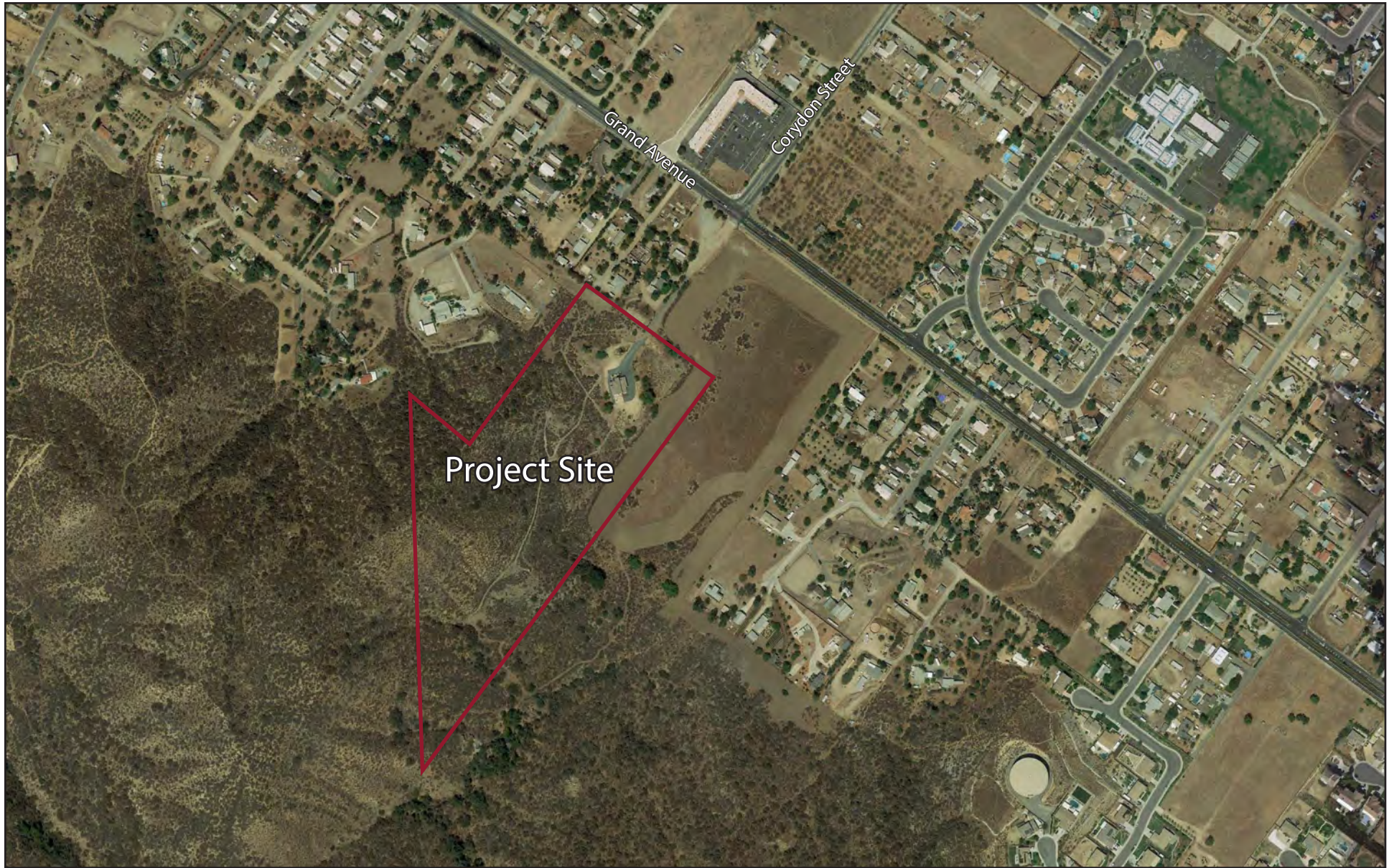
EXHIBIT 2: Site Vicinity Won Meditation Center City of Wildomar