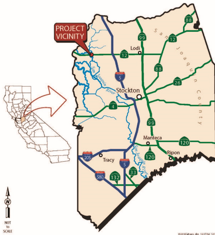
Figure 1. Project Vicinity Map

Figures 1 and 2 show where the proposed project area and the bridge location are within the San Joaquin County.