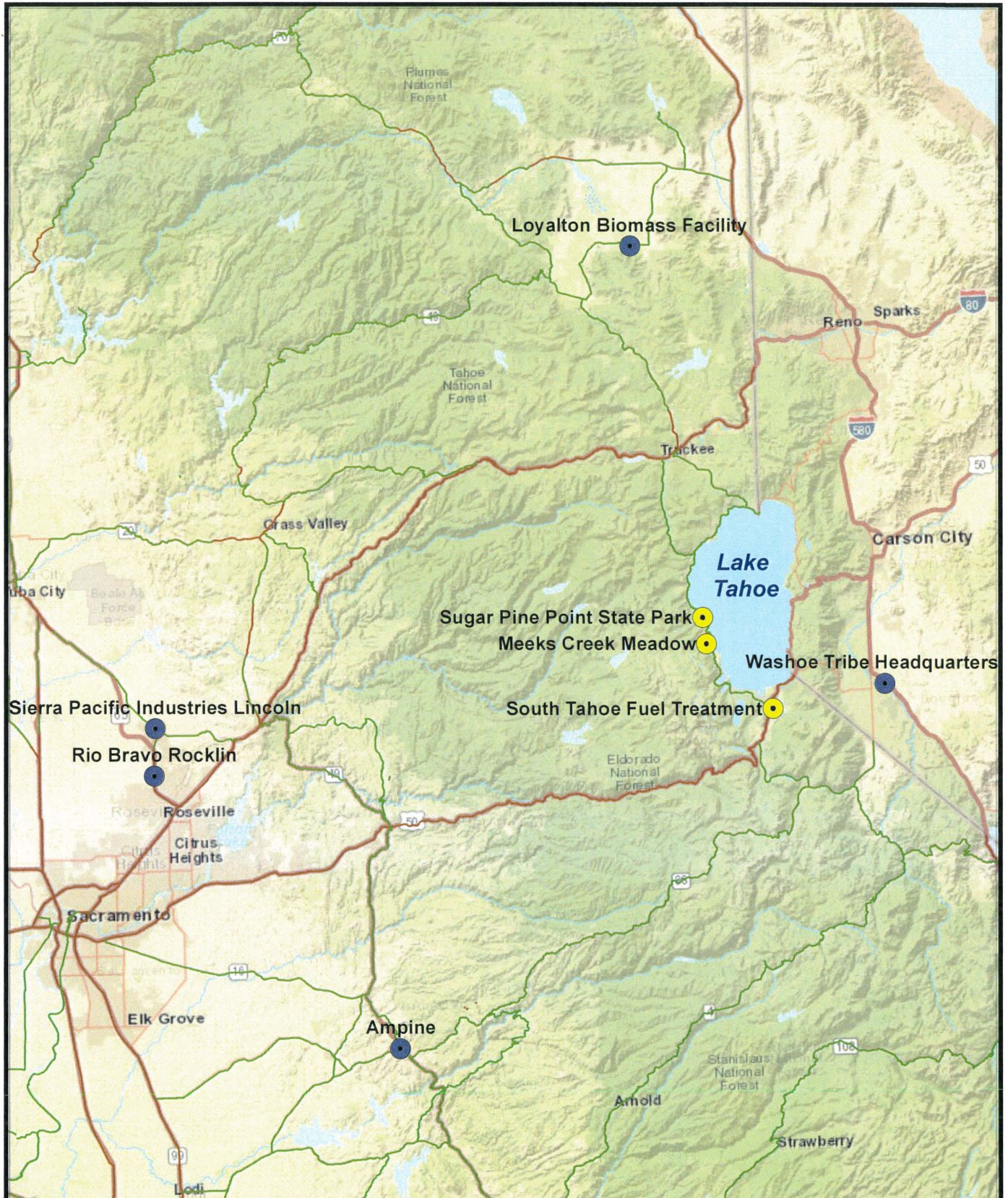
EXHIBIT A Biomass Transport and Utilization Project