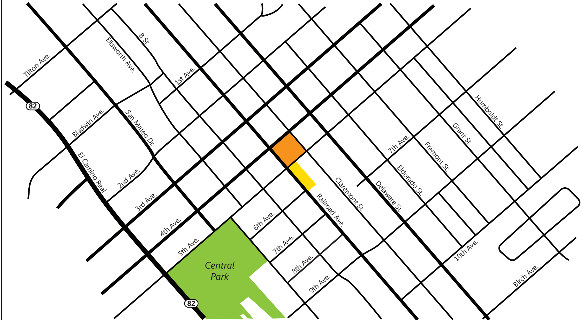
Figure 1: Vicinity Map