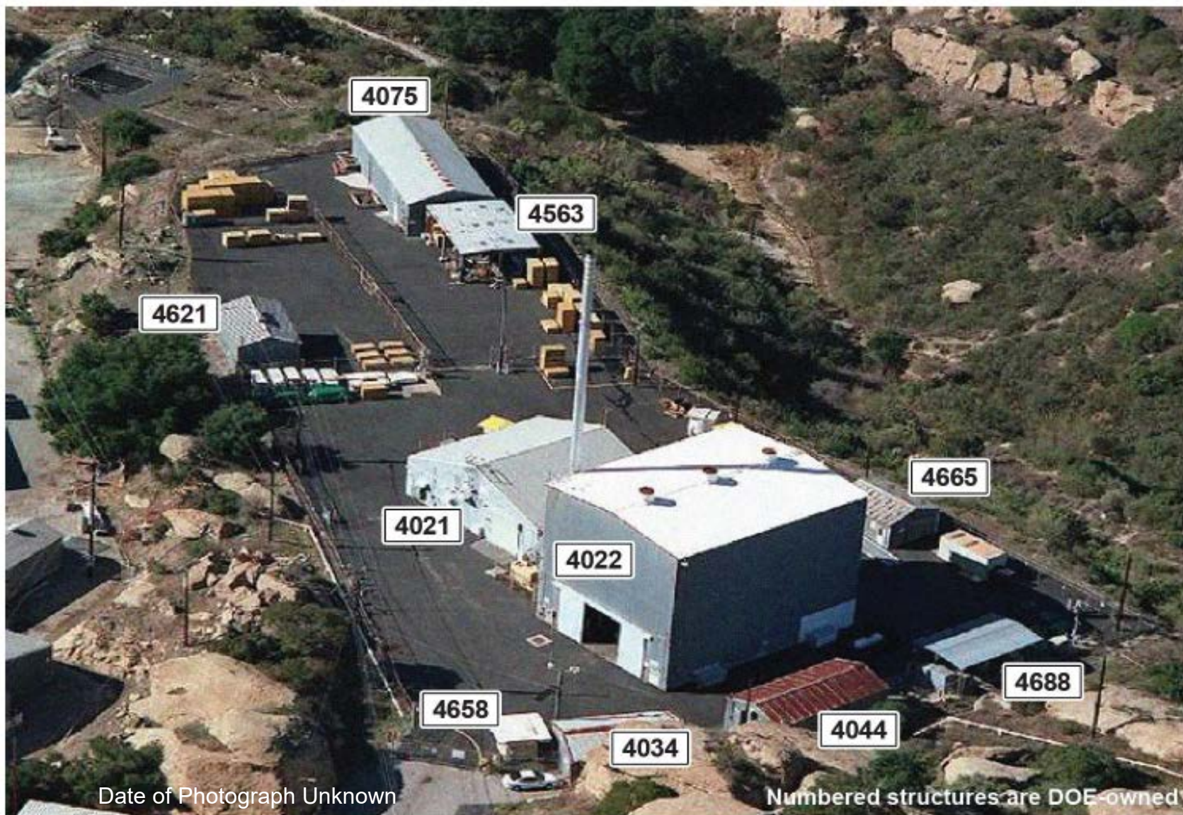
Figure D-2 Radioactive Materials Handling Facility Overview