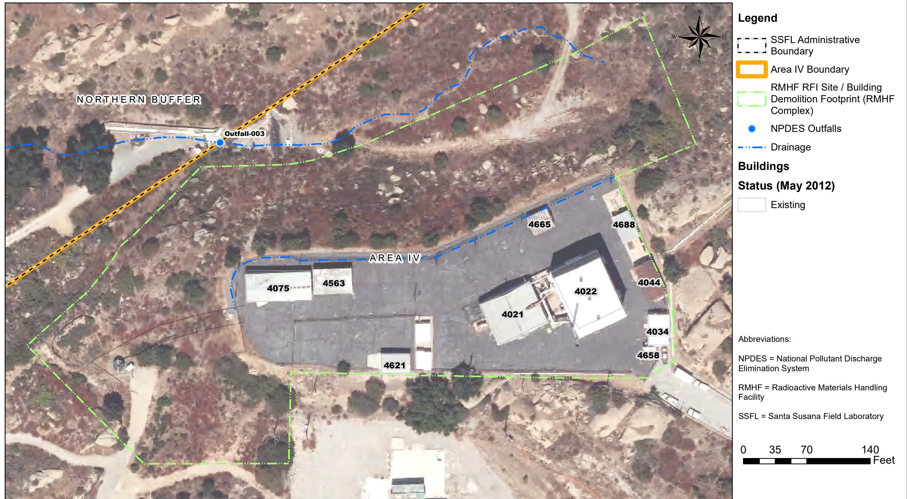
Figure 2: Radioactive Materials Handling Facility