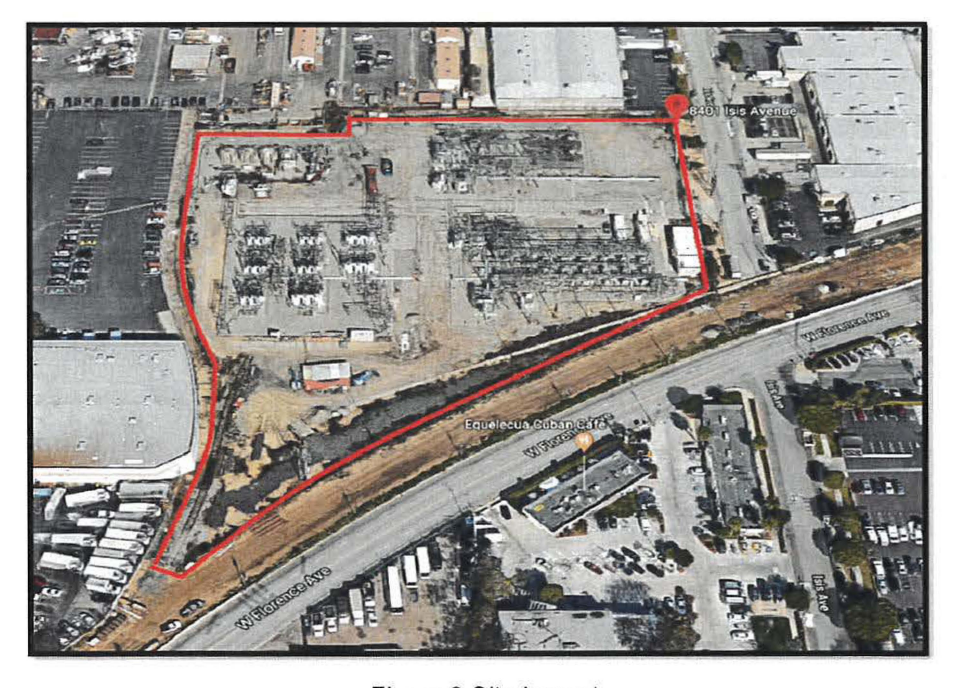
Figure 2 Site Layout