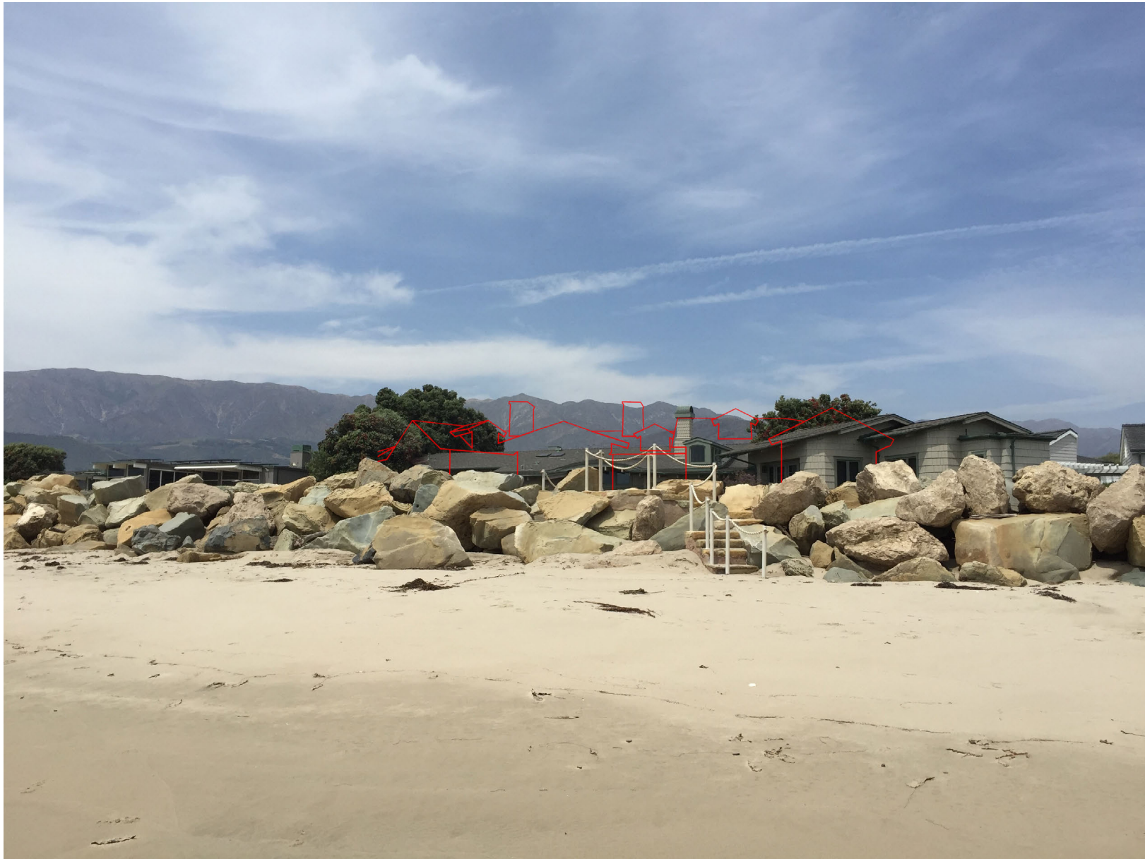
Image 1: Existing residence with proposed residence outlined in red (from beach looking north)