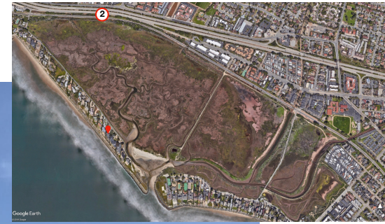
Image 2: View From Highway 101 Between Carp Ave. Exit and Santa Claus Ln.