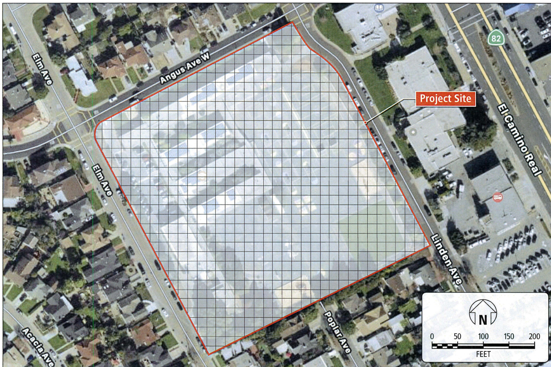
Figure 2 Aerial Photograph of Existing Campus and Project Site