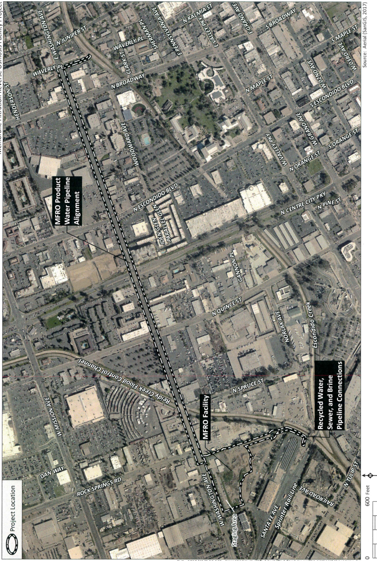
Project Location (Aerial Photograph)