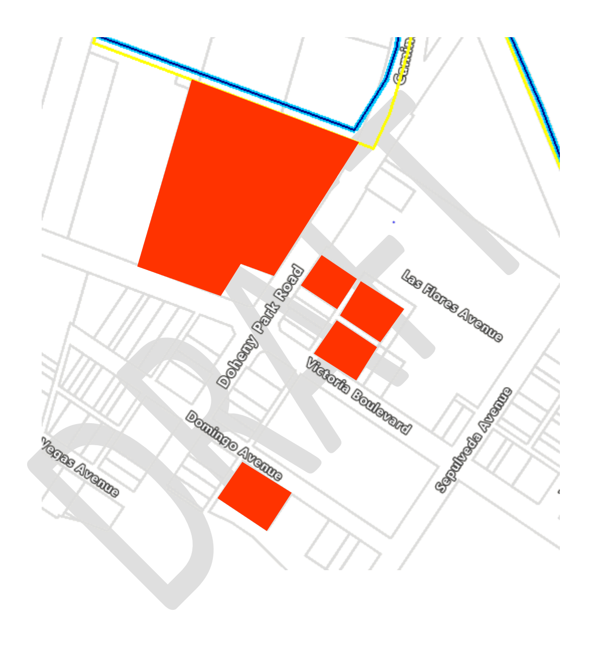
EXHIBIT C HOUSING INCENTIVE OVERLAY